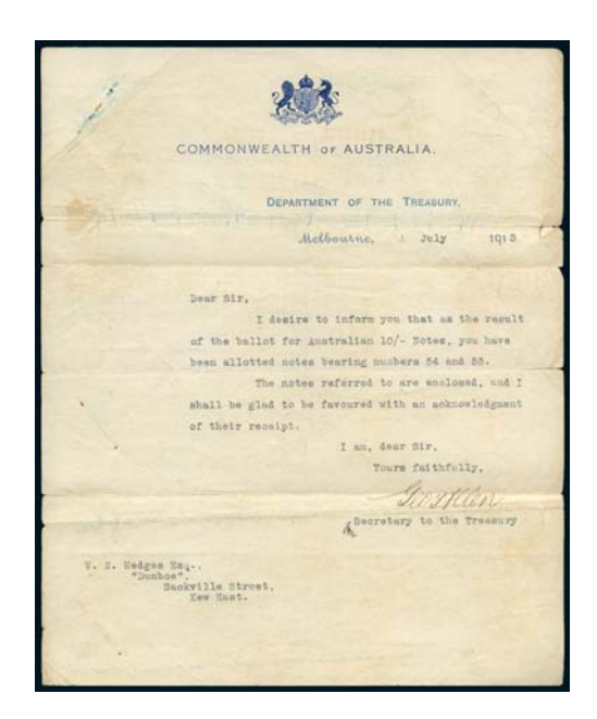
Lot 4502 part

The note ex M.P.Vort-Ronald Collection, Spink Australia Sale 24 (lot 14).