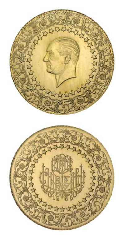
Turkey, Kemal Ataturk, five hundred kurush, 1965 Monnaie de luxe (KM.874). Uncirculated. $1,500