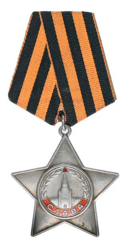
2233* Russia (USSR), The Order of Glory 3rd Class type 2, number 707642 engraved on reverse. Extremely fine.