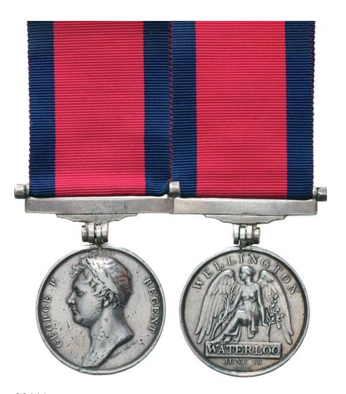
2011* Waterloo Medal 1815. Edwd Marcon Lieut 54th Regt Foot. Renamed, engraved. Contact marks in fields, good. $700