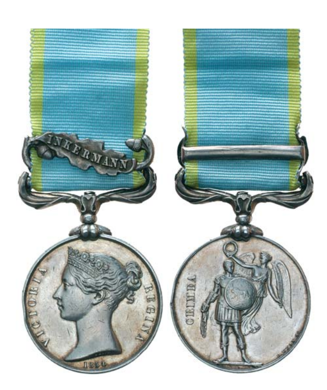
2023* Crimea Medal 1854, - clasp - Inkermann. R.Quayle 11th Hussars. Officially impressed. Obverse with edge bruise at 9 o'clock, very fine.