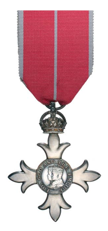
2166* The Most Excellent Order of the British Empire (MBE), Military (2nd Type) breast badge. Uncirculated.