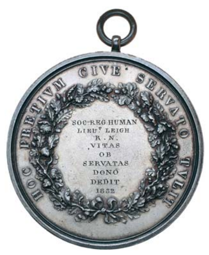
Lot 2117 part (following page)