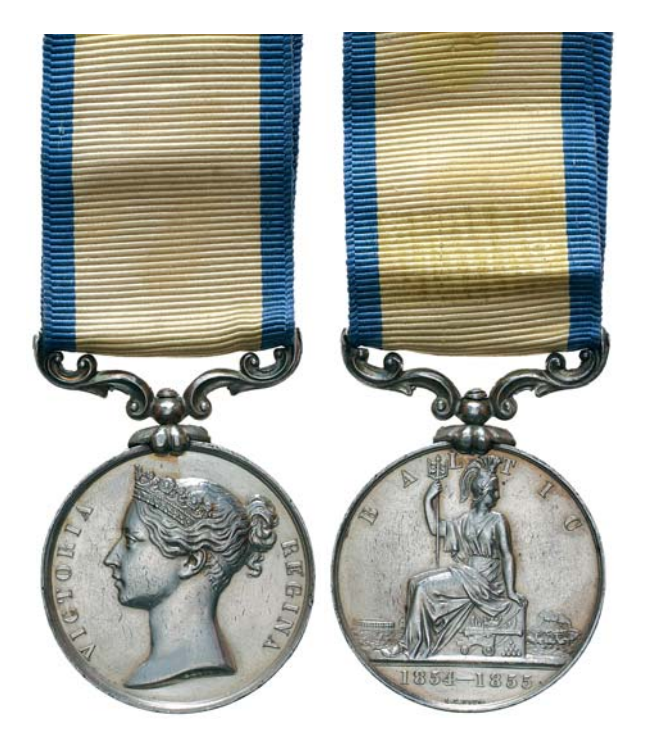
2028* Baltic Medal 1854-55. Unnamed. Good very fine.