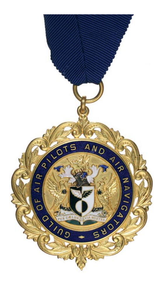
Lot 2069 part