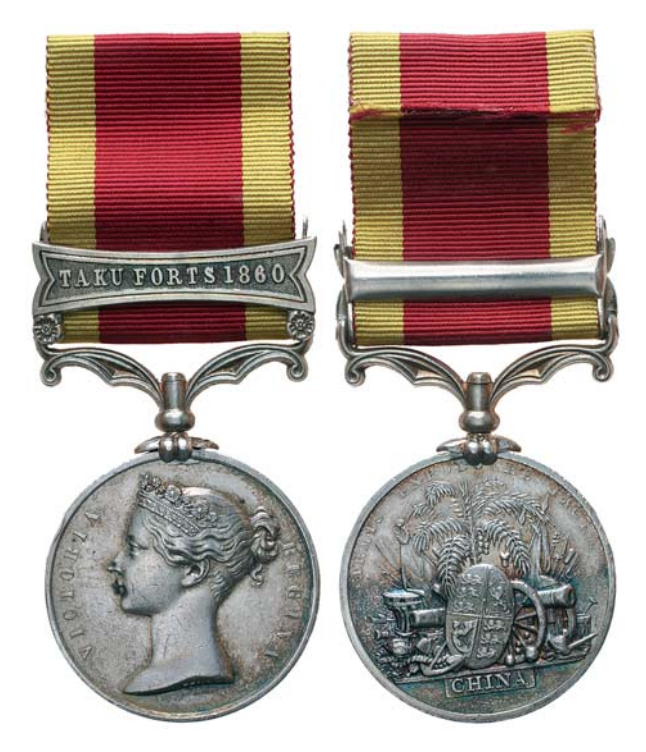
2030* Second China War Medal 1857-60 , - clasp - Taku Forts 1860. Unnamed. Knocks in fields, suspender re-affixed, very fine. $170