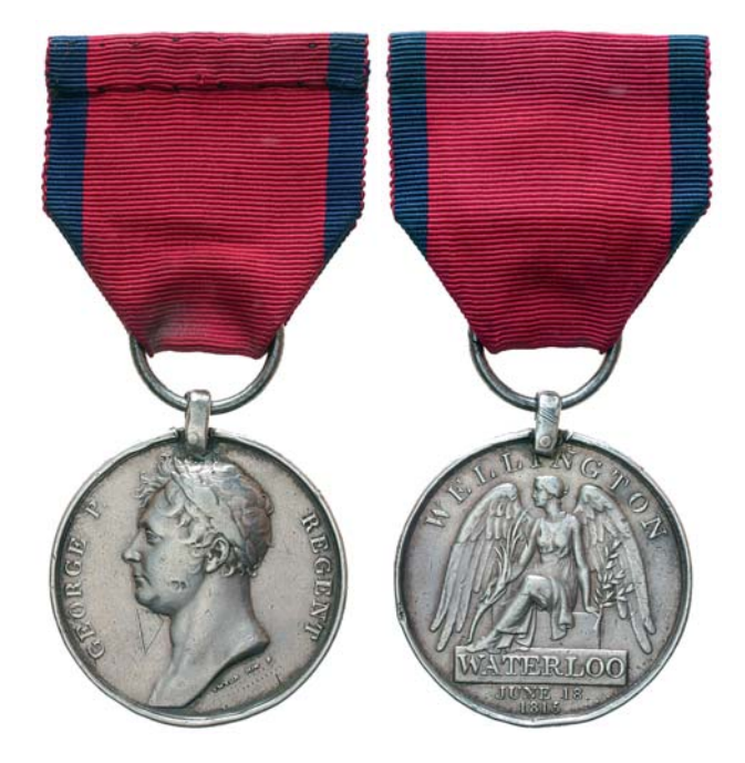
2009* Waterloo Medal 1815. Charles Day 1st Batt 52nd Reg Foot. Renamed, engraved. Reverse with edge bruise at 6 o'clock, 'D' scratched in obverse field, good. $700