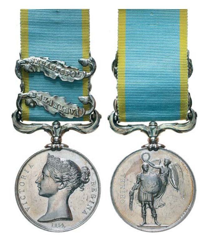
2022* Crimea Medal 1854, - two clasps - Balaklava, Sebastopol. Unnamed. Good very fine. $250