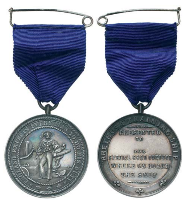
2046* Arethusa Training Ship Special Good Conduct Medal. Extremely fine. $100

Private purchase from Spink with their ticket.