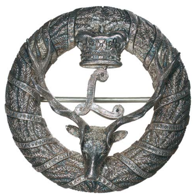
Lot 2063 part (previous page)