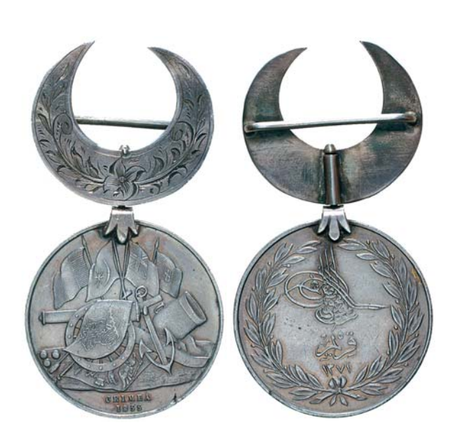
2025* Turkish Crimea Medal 1855, (British issue) with unofficial handcrafted suspender. Very fine.