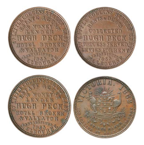
Peck , Hugh, Melbourne pennies, undated and 1862 (A.433, 434). Die axis at 180 degrees, nearly very fine - good very fine. (2) $200

1130 Petersen, W., Christchurch penny, undated (A.437). Fine. $100