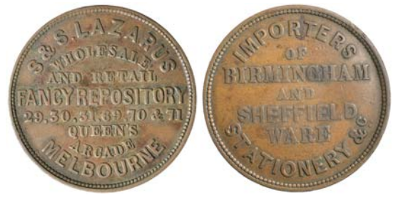
Lazarus, S. & S., Melbourne penny, undated (A.315). Nearly very fine.