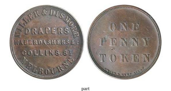
Miller Brothers, Melbourne penny, 1862 (A.373, 374); Miller & Dismorr, Melbourne penny, undated (A.375). First token obverse with planchet flaw at 2 o'clock, second token reverse with flaw on 'P', very good - nearly very fine. (3) $150