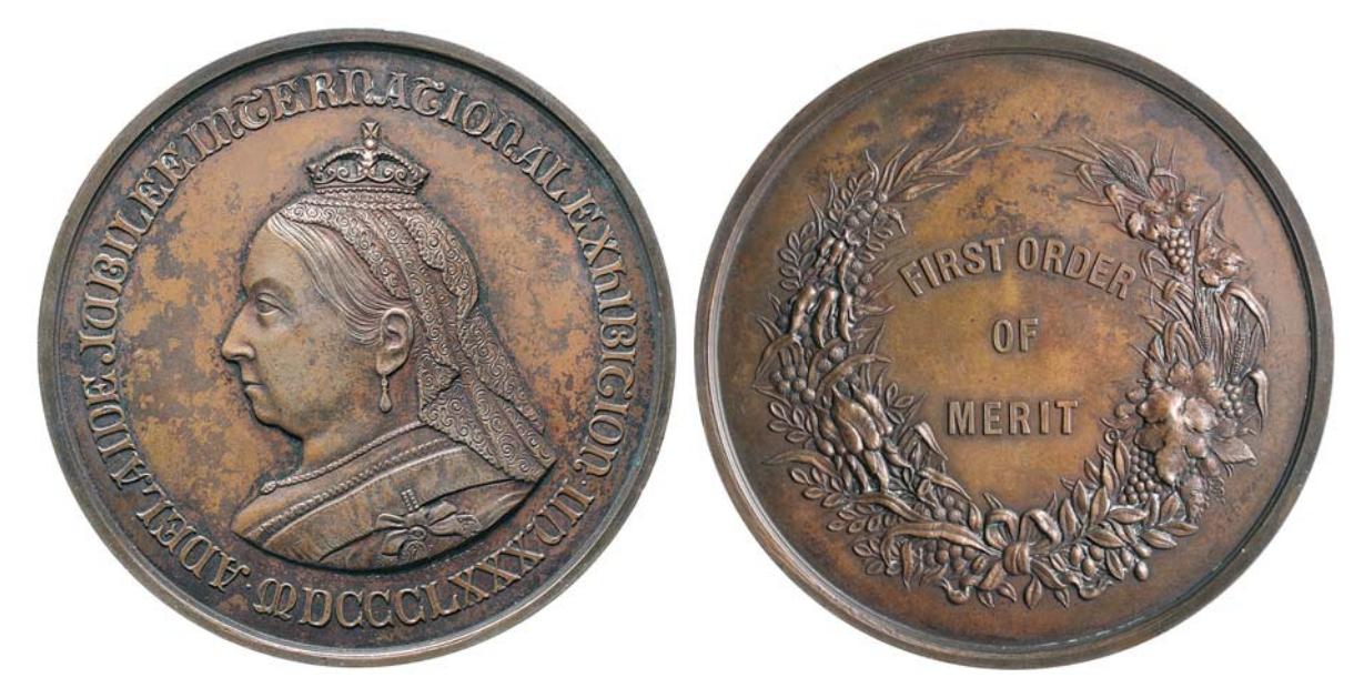
Adelaide Jubilee International Exhibition , 1887, First Order of Merit, in bronze (75mm) by E.A.Altmann.Melbourne (C.1887/5), unnamed. Extremely fine .