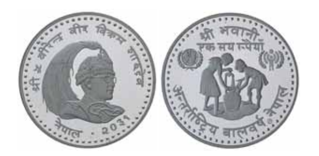
2506* Nepal , piedfort proof silver one hundred rupees (1981) (KM. P1). FDC and rare, only 88 struck.