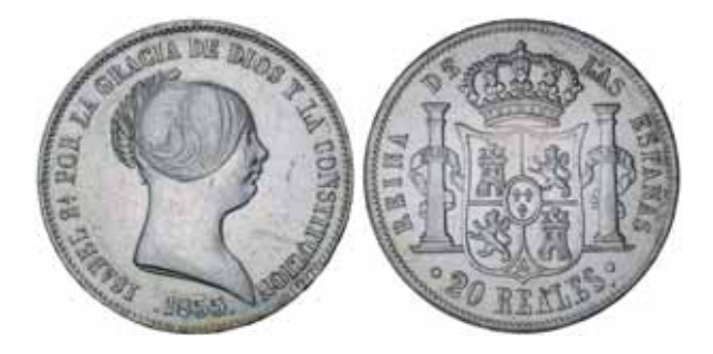
2577* Spain, Isabel, silver twenty reales, 1855 (KM.593.2). Cleaned, very fine.

Ex Gorny & Mosch Sale 12 (14 October 2002).