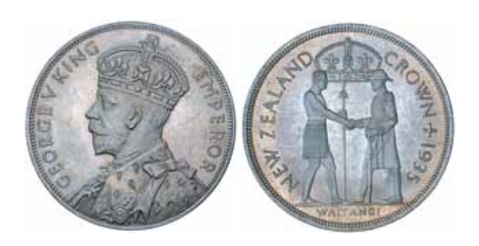
1216* George V, Waitangi crown, 1935. Lightly toned, brilliant fields, nearly FDC and rare.