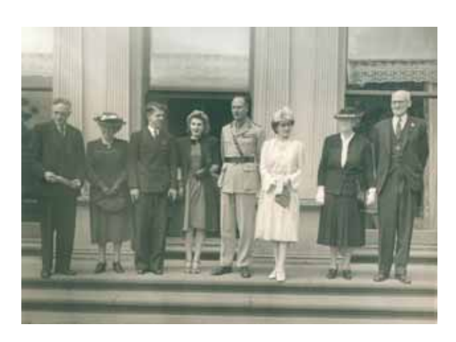
VC presentation day at Government House, Melbourne