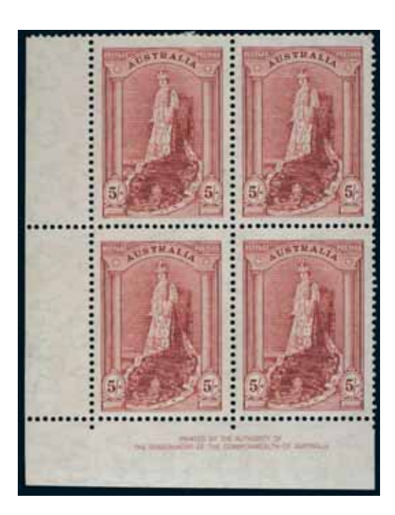
lot 4069 part