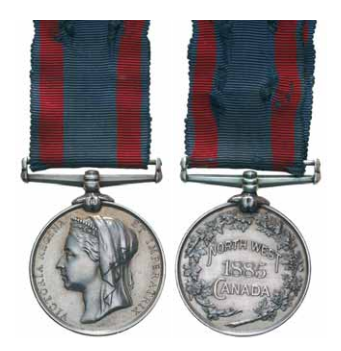
3914* North West Canada Medal 1885. Unnamed. Some contact marks, very fine. $300