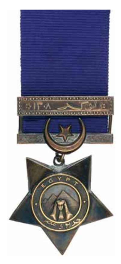
3913* Khedive's Star 1882, undated - clasp - Tokar (in Arabic). Unnamed. Very fine. $200