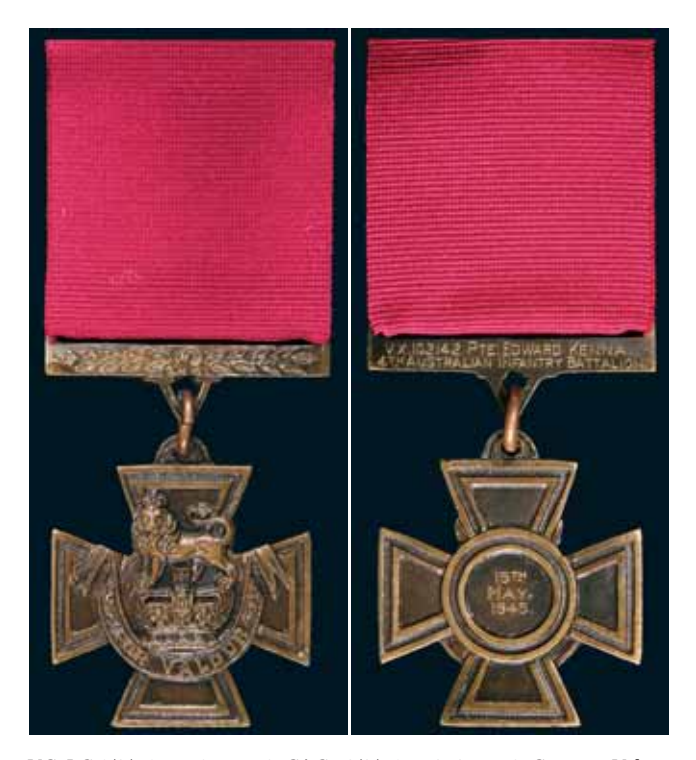
VC: LG 6/9/45, p4467, pos 2; CAG 13/9/45, p1979, pos 2. Citation: Valour of the highest order at Wirui Mission 15/5/45. (AMF O/A 29).

The full citation as recorded in LG Supplement 37253, pp4467-4468 is as follows; War Office, 6th September, 1945 The KING has been graciously pleased to approve the award of the VICTORIA CROSS to:- No. VX.102142 Private Edward KENNA, 2/4 Australian Infantry Battalion, Australian Military Forces.