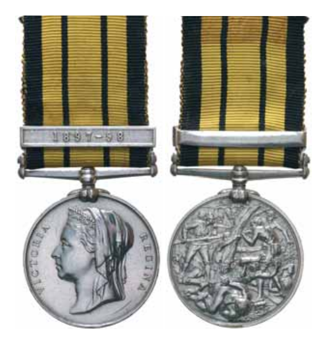
3915* East and West Africa Medal 1892, - clasp - 1897-98. Gnr: Gariba Kaniki. N.Nigeria Arty:. A few small rim bumps, otherwise very fine.