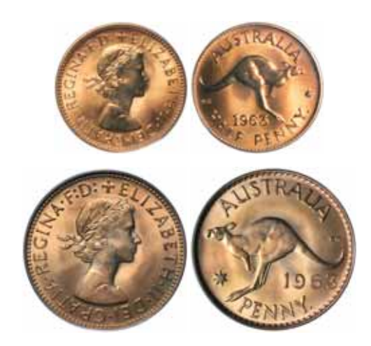
1537* Elizabeth II, Perth Mint proof set, 1963. FDC. (2)