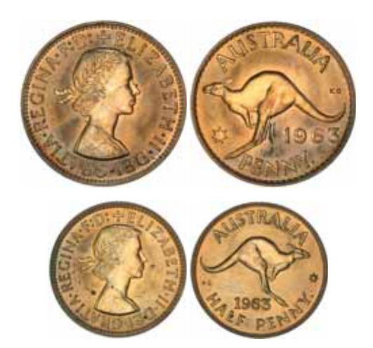
Elizabeth II, Perth Mint proof set, 1963. Some minor toning, otherwise nearly FDC. (2) $500