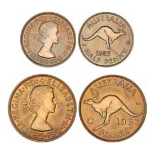
Elizabeth II, Perth Mint proof set, 1963. FDC. (2)