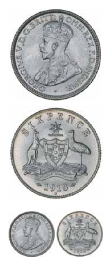
1628* George V, 1918M. Full frosty mint bloom, uncirculated/choice uncirculated and very rare in this condition, one of the finest known.