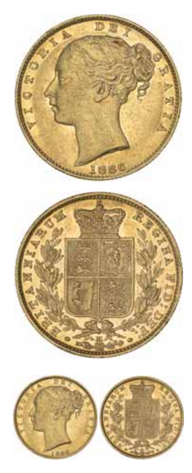
1406* Queen Victoria, 1886 Melbourne. Extremely fine/good extremely fine and very rare.