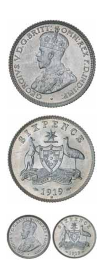
1629* George V, 1919M. Needle sharp strike, proof-like obverse, gem uncirculated and rare in this condition, one of the finest known if not the finest.