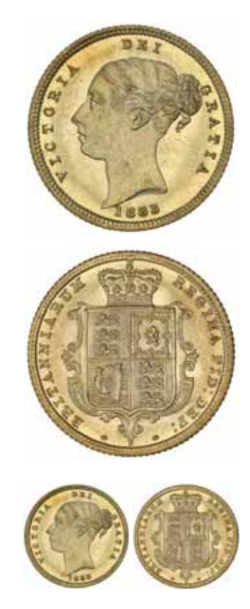
1472* Queen Victoria , 1883 Sydney (McD.25a). Full original mint bloom, choice uncirculated and very rare in this condition, one of the finest known.