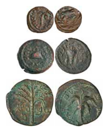
Lot 5330 part