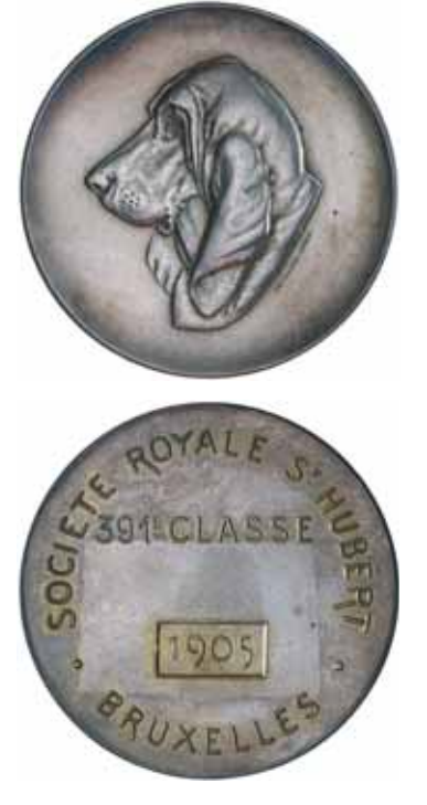
lot 4106 part