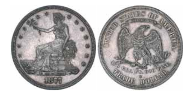
3858* U.S.A., trade dollar, 1877S. Nearly extremely fine.