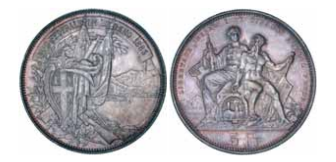
3823* Switzerland, shooting thaler, Lugano, 1883 (KM.X S16, D.390). Toned, nearly uncirculated.