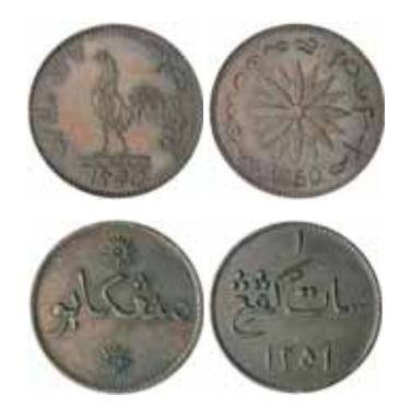
lot 3755 part