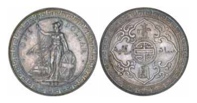
3524* British Trade dollar, 1930B, (KM.T5). Steel blue and gold tone, good extremely fine or better.