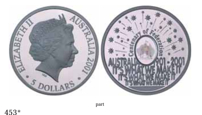
Elizabeth II , Millennium Hologram Series, proof silver five dollars, 2001 Centenary of Federation, 2002 Year of the Outback, 2003 Australia's Volunteers. In cases of issue with certificates, FDC. (3) $300