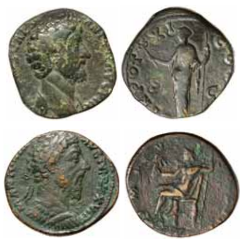
lot 5065 part