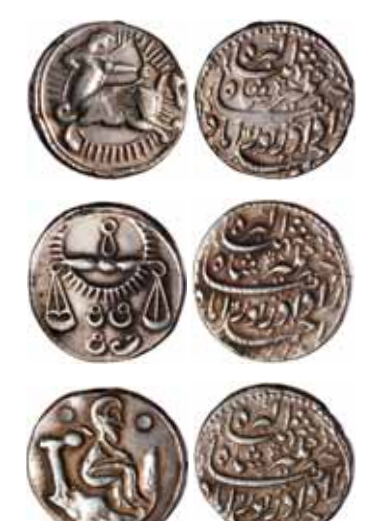
lot 5146 part

Mogul, Akbar, (A.H. 963-1014, A.D. 1556-1605), gold heavy mohur, (12.09 grams), Urdu Zafar Qarin mint, of good style, 'alif' dated AH 1000, (1591-2), (KM.SAC 119.4). Good very fine.