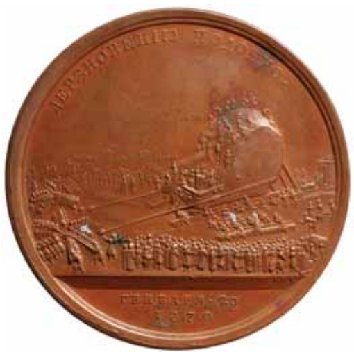
3784* Russia , Catherine the Great, medal in copper. 65.5mm, (96.29 grams), obv. portrait of Empress left. rev. construction of monument to Peter I, (Diakov 150.1). Trace of original clasp (for suspension), rare, and in unusually high grade, nearly uncirculated.