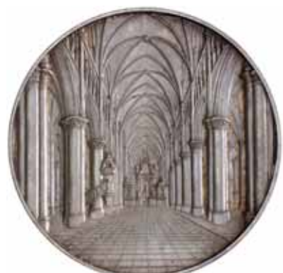
lot 3761 part