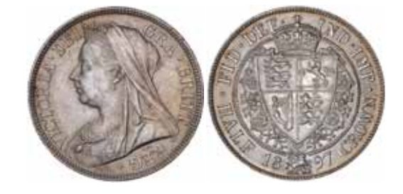
2506* Queen Victoria, old head halfcrown, 1897 (S.3938). Full frosty original mint bloom, about uncirculated.