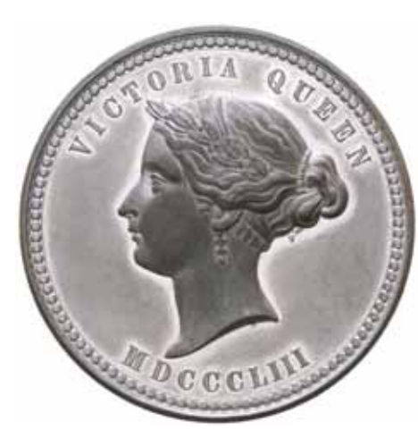
lot 1981 obverse