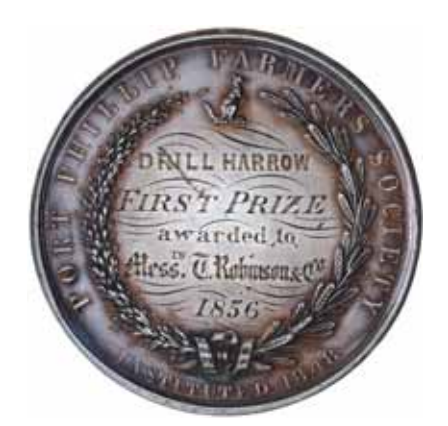
lot 1985 reverse