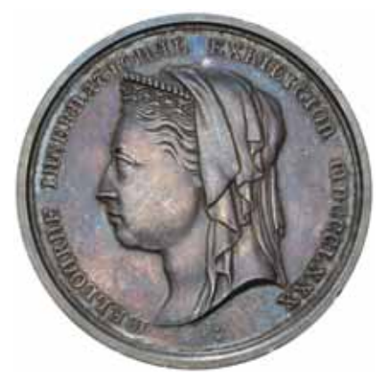
lot 1999 obverse only

For a silver example to Sir Samuel Wilson see Sale 80, lot 625.