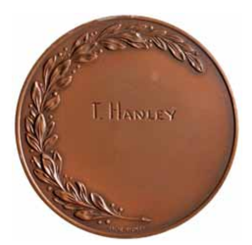
lot 2098 part