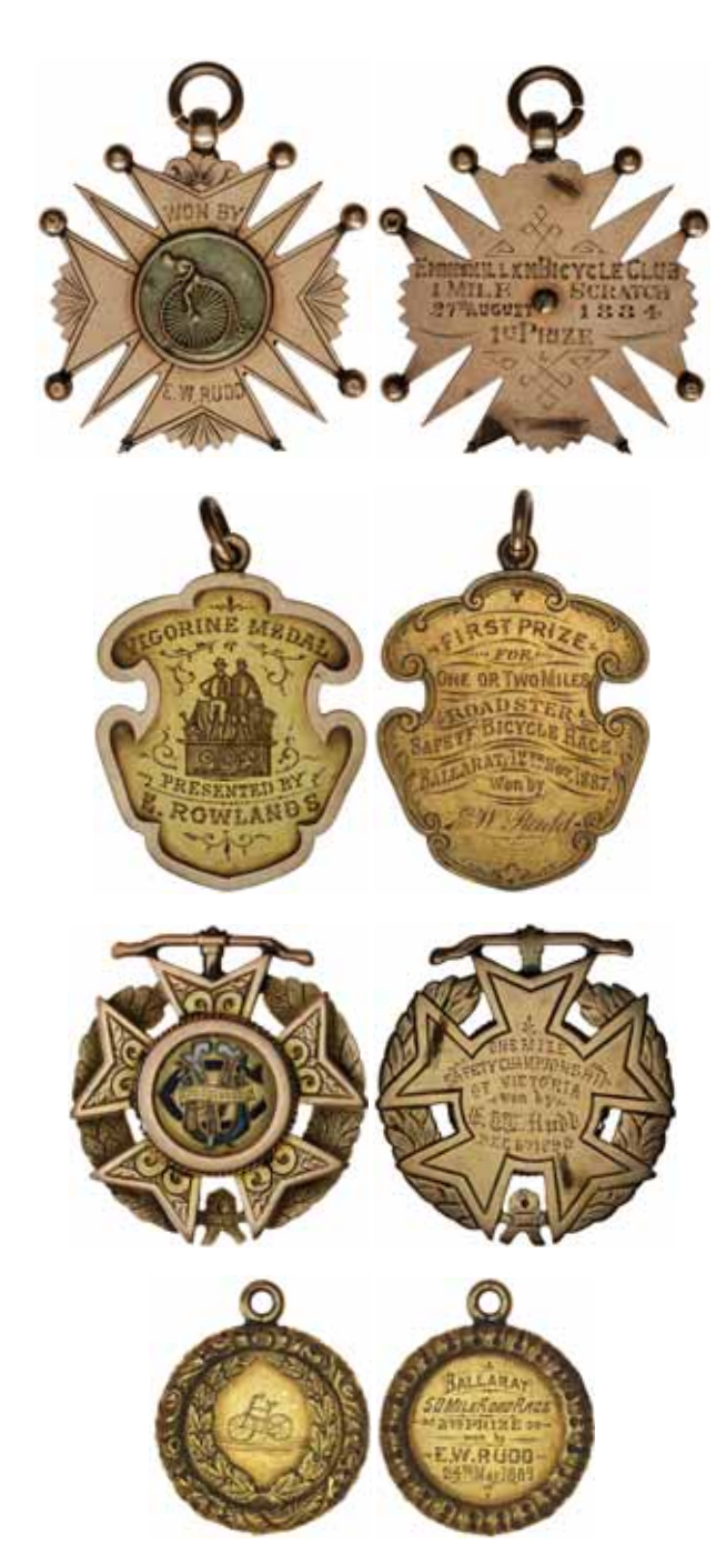
lot 2005 part