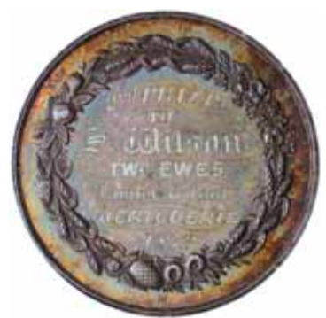
lot 1992 part