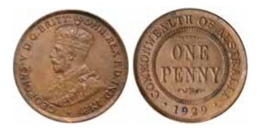
1624* George V, 1929, Indian die. Glossy brown with traces of original red, nearly uncirculated.