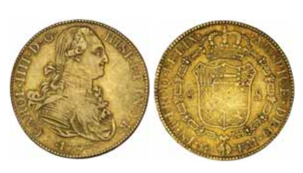
1278* Mexico, Charles IIII, eight escudos, 1793 FM Mo (KM.159). Weak in centre, otherwise very fine. $1,500