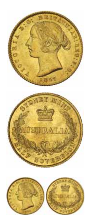
1317* Queen Victoria, second type, 1857, with wreathed head of Victoria left by L.C. Wyon. Considerable mint bloom, uncirculated and rare in this condition.