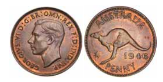
1636* George VI , 1946. Brown and red, uncirculated and rare in this condition.