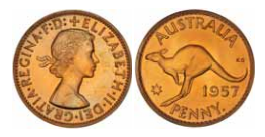
1453* Elizabeth II, Perth Mint proof penny 1957. Semi-brilliant FDC and rare as such for the second die type. $800

Elizabeth II , Melbourne Mint proof set, 1957. FDC . (4)