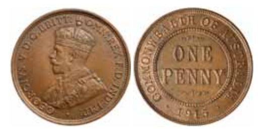
1609* George V , 1915. Brown with traces of dull red, good extremely fine. $1,000