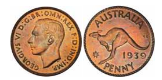
George VI, penny, 1939. Red and lilac blue patina, choice uncirculated.