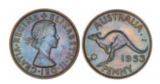
1444* Elizabeth II , Perth Mint proof penny, 1953. Dark toned, nearly FDC and very rare.