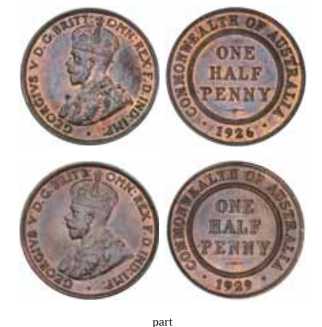
George V , 1926, 1927, 1929 and 1930. The last with carbon areas, others glossy with some red, nearly uncirculated. (4) $200