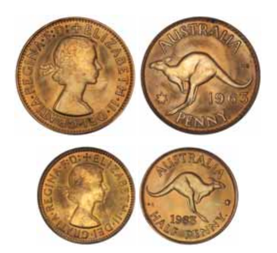
1472* Elizabeth II , Perth Mint proof set, 1963. Some dull toning, otherwise nearly FDC. (2)