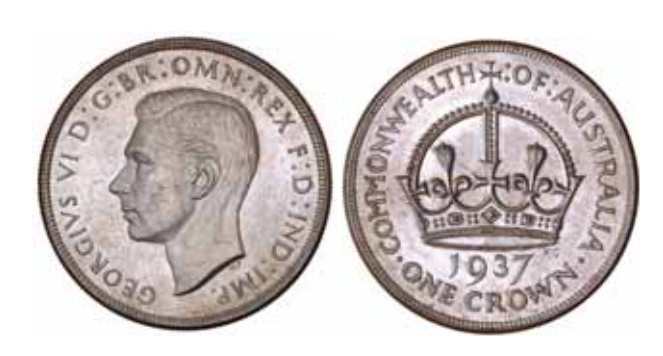
1502* George VI, 1937. Choice uncirculated.