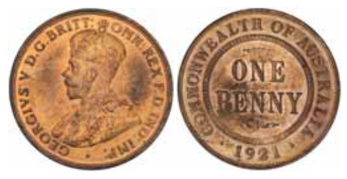
1617* George V, 1921 Indian die. Full original mint red, some carbon toned areas, uncirculated and rare in this condition, one of the finest known.