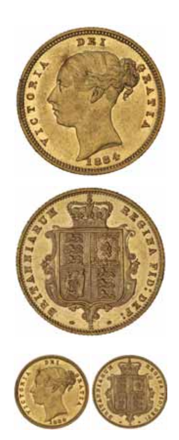
1414* Queen Victoria , 1884 Melbourne. Nearly uncirculated and rare in this condition. $9,000