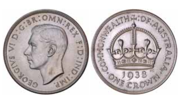
1492* George VI, crown, 1938. Well struck and relatively mark free, uncirculated. $500