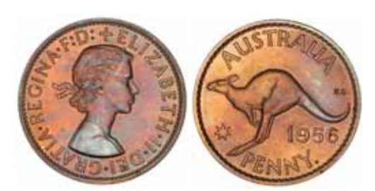
1450* Elizabeth II, Perth Mint proof penny, 1956. Uneven tone, nearly FDC and rare. $3,500