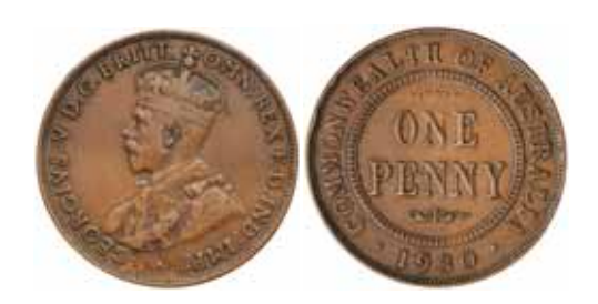
1627* George V, 1930 Indian die. Two small edge bumps and small rim nick, fine and rare.