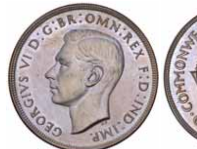
ON 1938 A