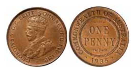
1635* George V, 1935. Brown with traces of red, uncirculated. $200