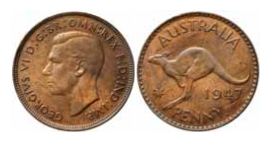
1639* George VI, 1947 Perth. Attractive red brown patina, nearly uncirculated and scarce thus. $100