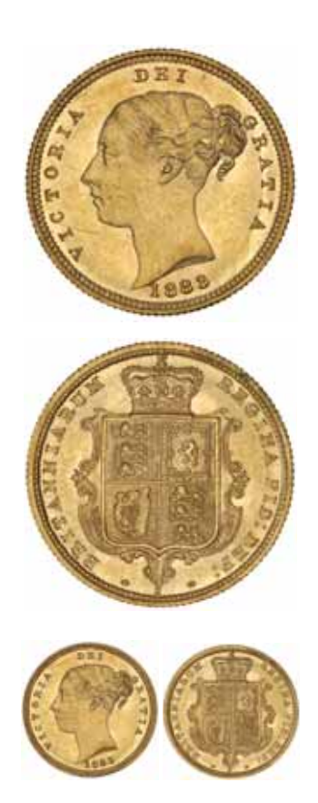
1411* Queen Victoria , 1883 Sydney (McD.25a). Scratch on obverse, otherwise nearly uncirculated/uncirculated. $8,000