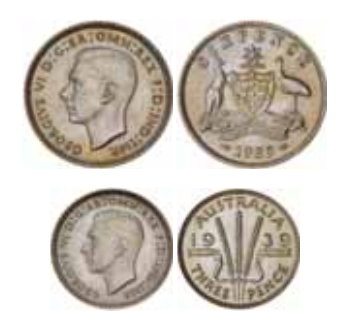
George VI, sixpence and threepence, 1939. Olive tone highlights, otherwise choice uncirculated. (2)