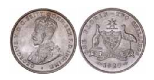
1525* George V, 1927. Full frosty mint bloom, uncirculated. $1,000