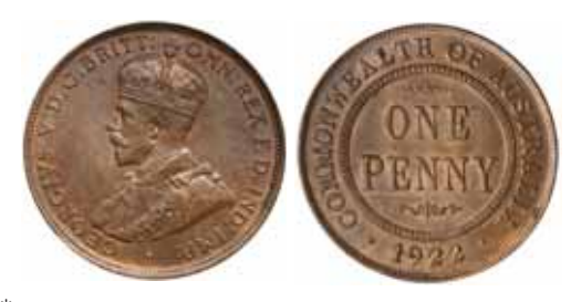
1619* George V, 1922, London die. Glossy brown with mint red, nearly uncirculated. $200