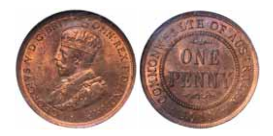
1607* George V, 1911. Nearly full original dark mint red, some toning on the reverse, uncirculated.