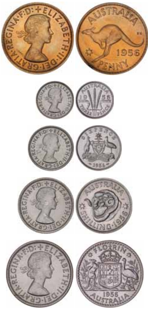
1447* Elizabeth II, Melbourne Mint proof set, 1956. FDC. (5) $1,250

1448 Elizabeth II, Melbourne mint proof silver set, 1956. FDC . (4) $650