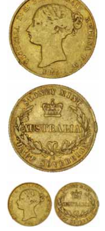
1314* Queen Victoria, first type, 1855. With spade gash on reverse rim at 3 o'clock, otherwise evenly worn nearly fine/fine and very rare.