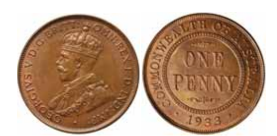
1633* George V, 1933. Glossy brown and red uncirculated. $200