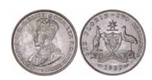
1524* George V , 1927. Full original satin or pearl-like mint bloom, uncirculated. $1,000