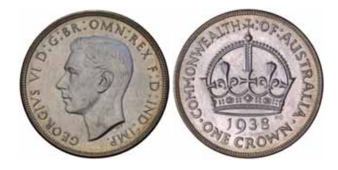
George VI, 1938. Some original bloom, extremely fine. $150