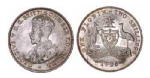
George V, 1926. Considerable original mint bloom, golden brown toning in parts, nearly uncirculated and rare in this condition.