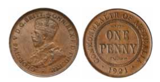
1618* George V , 1921 Indian die. Brown mint bloom patina, nearly uncirculated and rare.