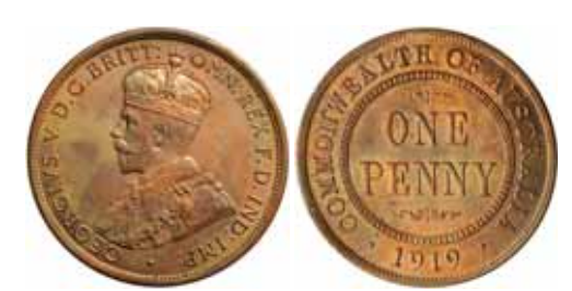
1615* George V, 1919. Dull toned, uncirculated.