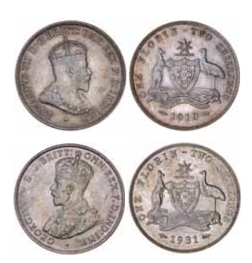
lot 1474 part