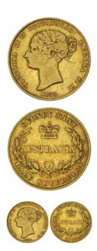
1313* Queen Victoria , first type, 1855, with filletted head of Victoria left by James Wyon. Nearly very fine but with two old obverse scratches, very rare and probably the seventh or eighth finest known. $70,000