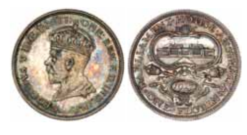
1440* George V , Melbourne Mint proof or specimen Canberra commemorative florin, 1927. Field scuffs in front of face, deeply toned with subdued brilliance in parts, nearly FDC and rare.