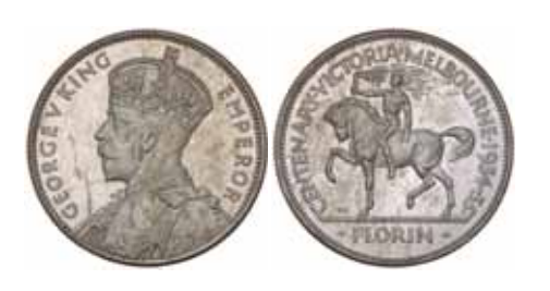
1528* George V , 1934-35. Proof-like uncirculated .