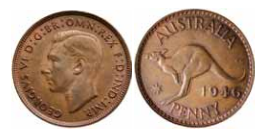
1637* George VI , 1946. Blue brown toned, nearly uncirculated. $2,500