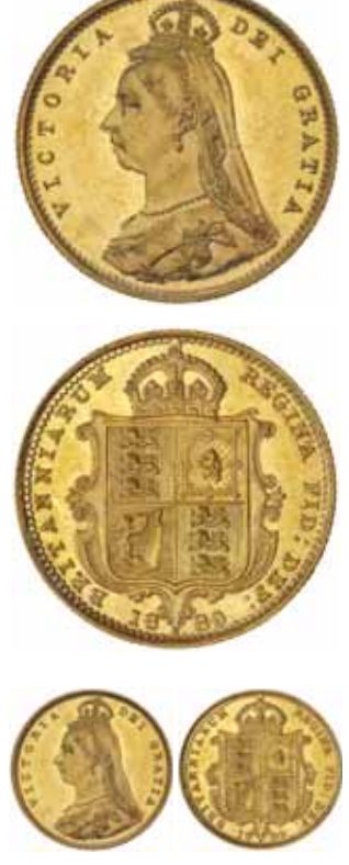
1422* Queen Victoria, 1889 Sydney. Full mint bloom, gem uncirculated, probably the finest known. $28,000

Ex Spink Noble Sale 39 (lot 181) and Sale 48 (lot 1648).