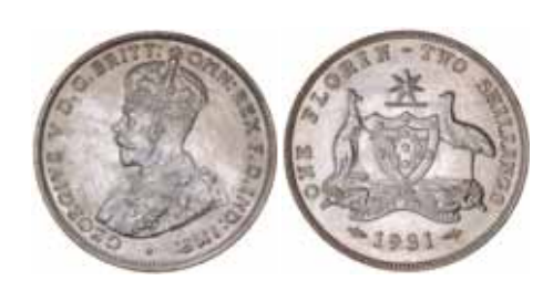
1527* George V, 1931. Uncirculated.