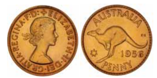
1449* Elizabeth II, Melbourne Mint proof penny, 1956. Full brilliant mint red, FDC.

1448 Elizabeth II, Melbourne mint proof silver set, 1956. FDC . (4) $650