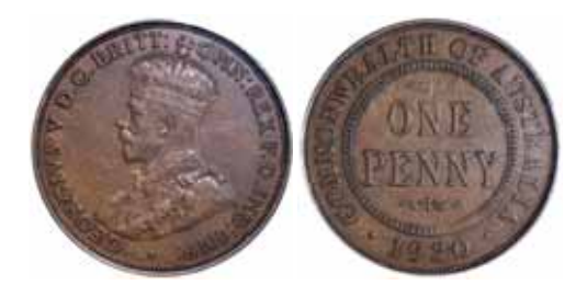
1625* George V , 1930. Good very fine/nearly extremely fine and very rare in this condition, probably the fourth or fifth finest known.