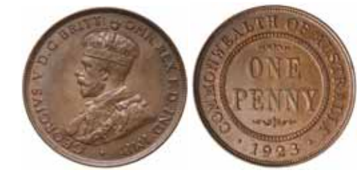
1620* George V, 1923, London die. Glossy brown with traces of mint red, nearly uncirculated.