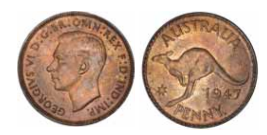
1638* George VI, 1947 Perth. Subdued full original mint bloom, uncirculated.