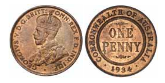
1634* George V, 1934. Red and brown, uncirculated.