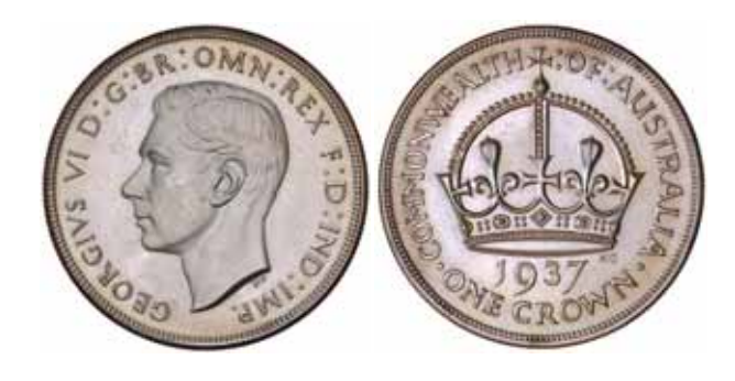
1491* George VI , crown, 1937. Well struck, uncirculated.