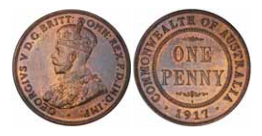
1613* George V , 1917I. Glossy grey and red brown, nearly uncirculated. $400