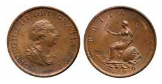
Great Britain, George III, copper halfpenny, 1799 (S.3778). Brown and red toned, nearly uncirculated. $150