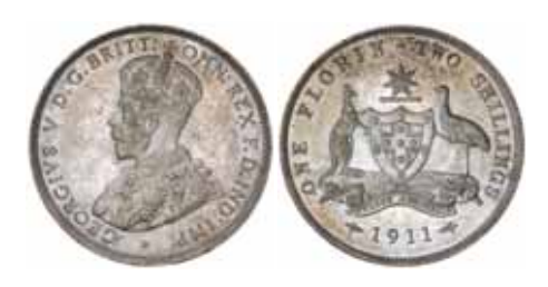
1505* George V , 1911. Toned area, original mint bloom, nearly uncirculated and rare in this condition.