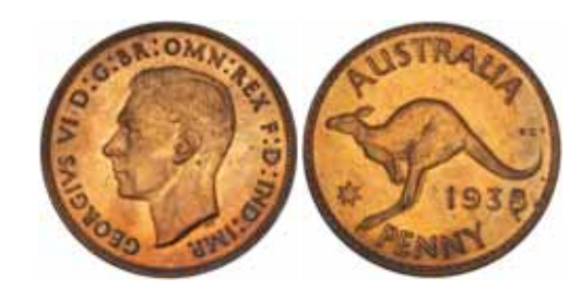
1495* George VI , penny, 1938. Brilliant full mint red, choice uncirculated. $300

George VI, shilling, sixpence and threepence, 1938. The threepence with considerable brilliance, the shilling dipped of toning, uncirculated. (3) $300