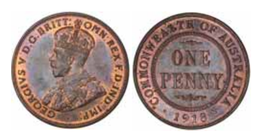
1614* George V, 1918I. Grey brown with some original mint red, nearly uncirculated. $500