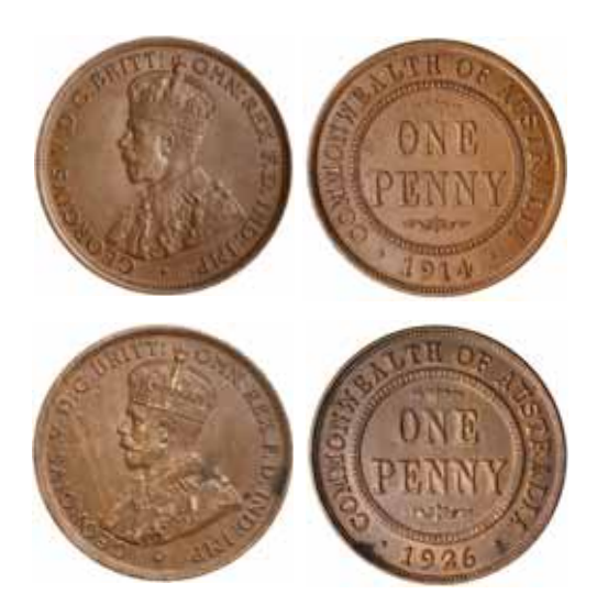
1608* George V , 1914 and 1926. Second from pitted or deteriorated dies, extremely fine or better. (2)