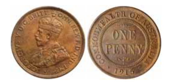
1611* George V, 1915H. Brown with faint red, good extremely fine and rare.