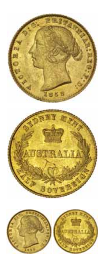
1318* Queen Victoria, second type, 1858. Full original mint bloom, nearly uncirculated/uncirculated and rare in this condition.

Ex Indian hoard 1976, private purchase from Spink Australia in 1976.