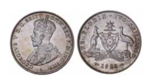
1526* George V, 1928. Orange peel effect in fields, lightly toned, nearly uncirculated. $200