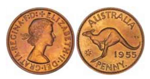
1446* Elizabeth II, Perth Mint proof penny, 1955. Nearly FDC and rare. $5,000

1445 Elizabeth II, Melbourne Mint proof silver set, 1955. FDC . (3) $500