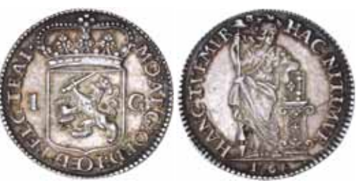
1279* Netherlands, Utrecht, silver guilder (gulden), 1764 (KM.102). Toned, extremely fine rare as such. $120