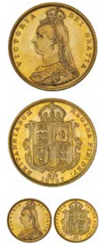
1417* Queen Victoria , Jubilee head, 1887 Melbourne (McD.33c). Full golden gem uncirculated, probably the finest known. $10,000