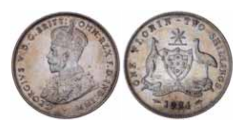
1009* George V, 1924. Softly struck up reverse, extremely fine with mint bloom.