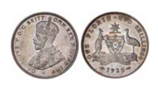
1014^{\ast} George V, 1925 and 1927. Some mint bloom, extremely fine. (2) $$300