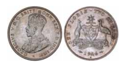
997* George V, 1915H, 1916M, 1921 and 1922. Fine - good very fine. (4) $240