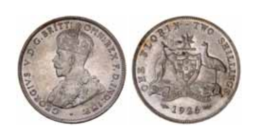
1015* George V , 1926. Considerable original mint bloom and well struck for this date, nearly uncirculated. $400