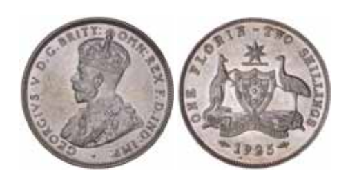
1013* George V , 1925. Cleaned, otherwise extremely fine with semi mirror-like fields. $100