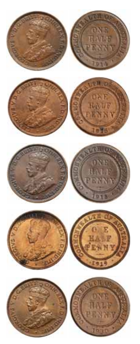
lot 1252 part

1245 Elizabeth II, 1954. Ex mint rolls, uncirculated. (13) $130 1246 Elizabeth II, 1954. Ex mint rolls, uncirculated. (16) $150 1247 Elizabeth II, 1961. Ex mint rolls, uncirculated. (40) $100 1248 Elizabeth II, 1961. Ex mint rolls, uncirculated. (42) $120 1249 Elizabeth II, 1962. Ex mint rolls, uncirculated. (24) $70 1250 Elizabeth II, 1963. Ex mint rolls, uncirculated. (28) $80 1251 Elizabeth II, 1964. Ex mint rolls, uncirculated. (28) $50