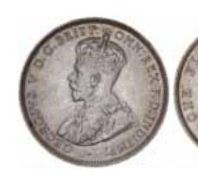
George V, 1912. Good very fine.