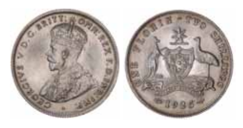
1011* George V , 1925. Scratches in obverse field, buffed, otherwise good extremely fine/nearly uncirculated. $400