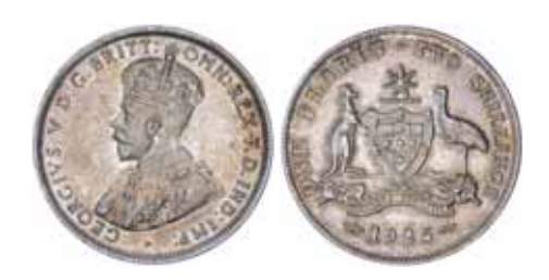
1012* George V, 1925. Slightly rubbed, otherwise extremely fine/nearly extremely fine. $150