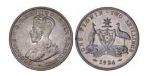
1008* George V , 1924. Orange peel effect obverse fields, extremely fine/nearly uncirculated. $800