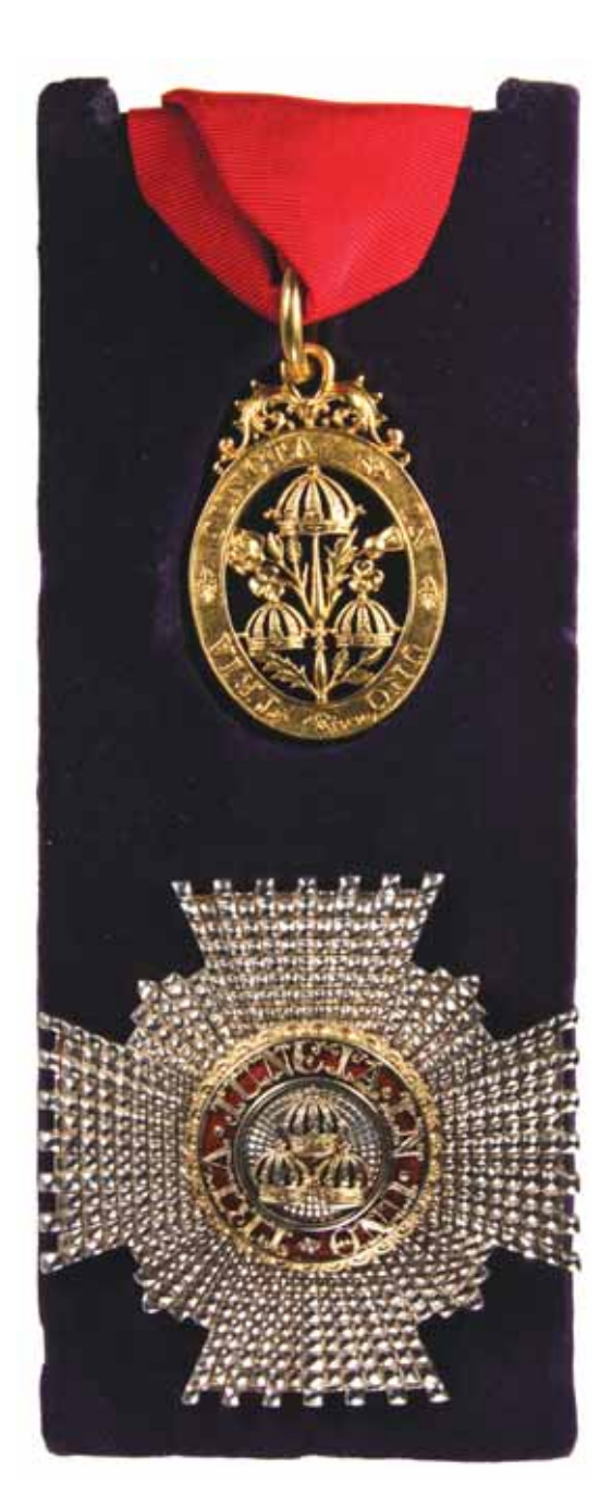
5581* The Most Honourable Order of the Bath , Knight Commander (KCB), civil badge in 18ct gold , hallmarked 1861 (Garrard) and breast star in gold, gilt and silver. On fitted, plush holder,