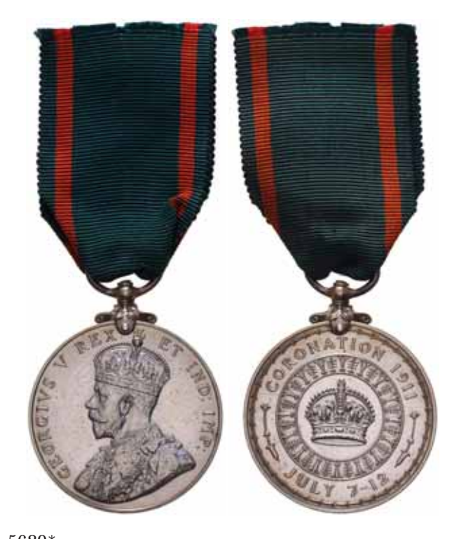
5680* Visit to Ireland Medal 1911. Unnamed. Extremely fine.