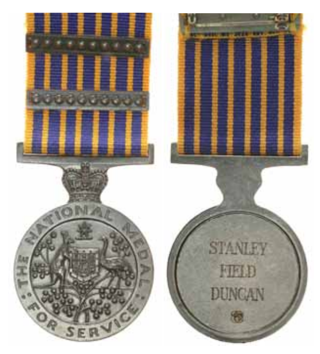
5732* National Medal with two clasps. Stanley Field Duncan. Engraved. With case. Extremely fine . $350