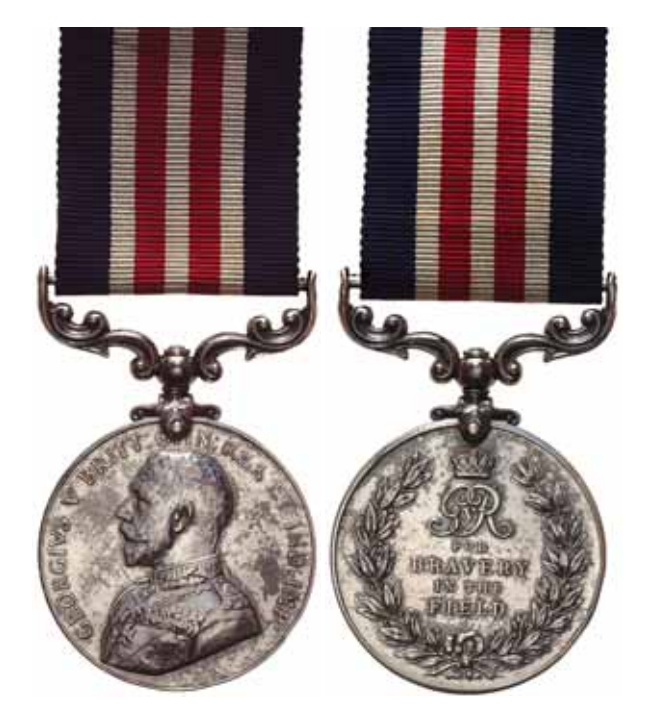
5586* Military Medal (GVR). 19348 Pte F.Ogden. 11/N. & D.R. Impressed. Some pitting in reverse field, a few small edge bumps, otherwise very fine.