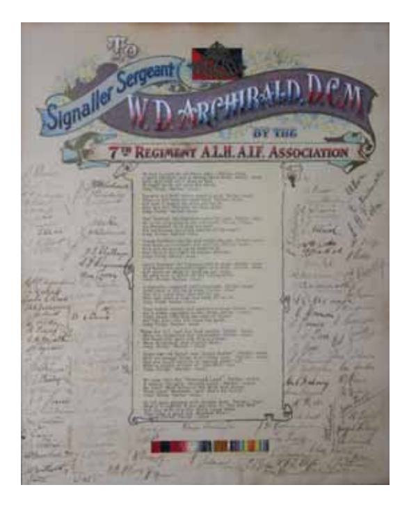
lot 5736 part