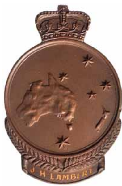
5813* ANZAC Commemorative Medal, 1967, engraved J.H.Lambert. In case of issue, extremely fine.