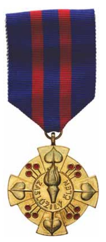
lot 5835 part