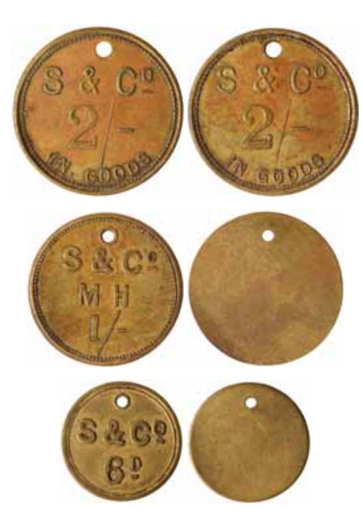
lot 2855 part