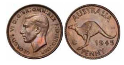
1693* George VI, 1945 Perth; also 1951 PL halfpenny. Brown and red uncirculated; choice uncirculated. (2)