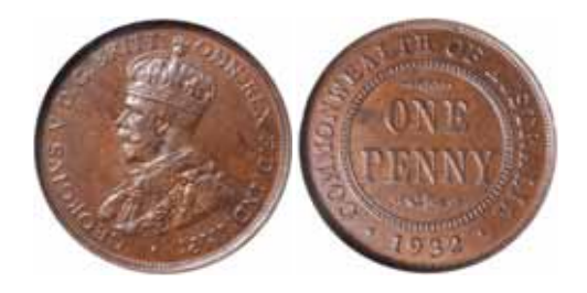
1689* George V , 1932. Proof-like dark purple brown patina with a cameo contrast, choice uncirculated and rare thus. $500