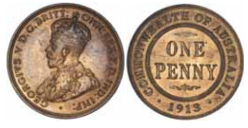
1654* George V , 1913. Full original mint red, blue grey toned area on obverse and light strike in places, choice uncirculated, one of the finest known.