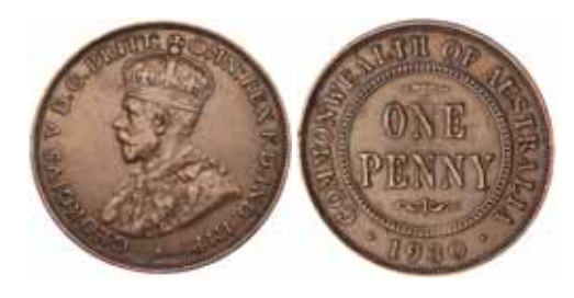
1687* George V , 1930, Indian die. Obverse with fault at 6 o'clock, nearly very fine and rare. $17,500