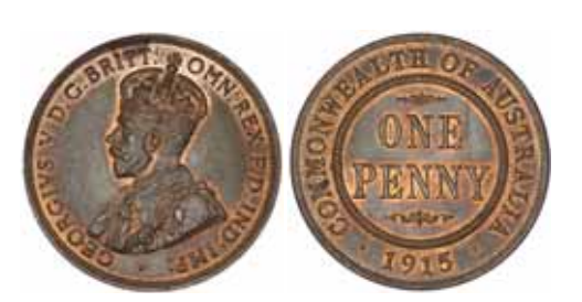
1658* George V , 1915. Well struck, brown and red uncirculated and very rare in this condition, one of the finest known. $8,000

Ex Noble Numismatics Sale 82 (lot 1440).