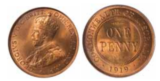
1663* George V, 1919. Slightly soft strike on scrolls, full cartwheeling patinated mint red, choice uncirculated and rare thus.