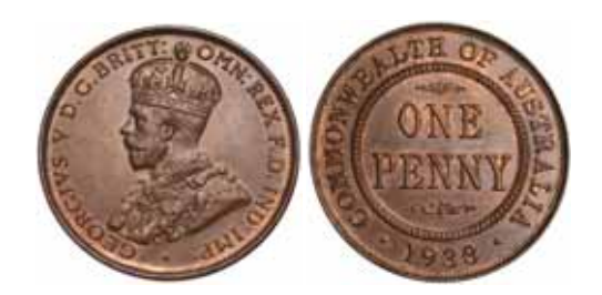
1690* George V , 1933/2 overdate. Glossy medium brown and mint red uncirculated and very rare in this condition, one of the finest known.