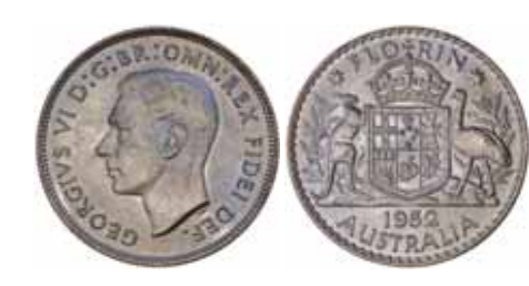
1586* George VI , 1952. Choice uncirculated.