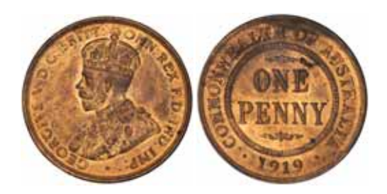
1666* George V, 1919 dot below. Carbon spot, red and brown uncirculated.