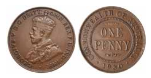
1685* George V , 1930 Indian die. Nearly very fine and rare in this condition.