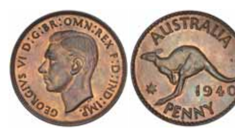
1691* George VI, 1940 K dot G. Brown and red uncirculated and very rare as such, one of the finest known. $3,000