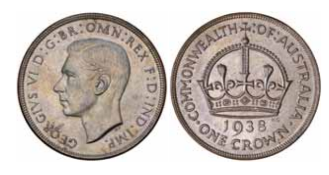
1542* George VI, 1938. Nearly uncirculated.