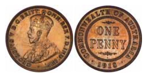
1662* George V , 1918 I. Reverse die clashed, cleaned of patina otherwise good extremely fine and rare in this condition.