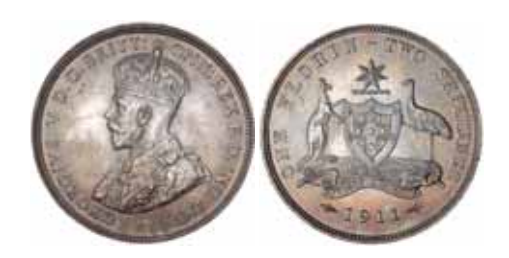
1547* George V, 1911. Choice uncirculated and very rare in this condition, one of the finest known.