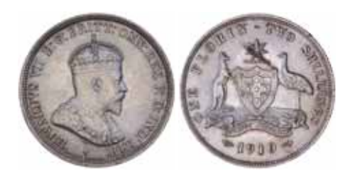
1546* Edward VII , 1910. Good extremely fine.