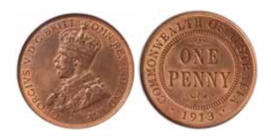
1655* George V, 1913. Obverse brown and red, reverse nearly full original mint red and well struck, uncirculated/choice uncirculated and rare in this condition, one of the finest known.