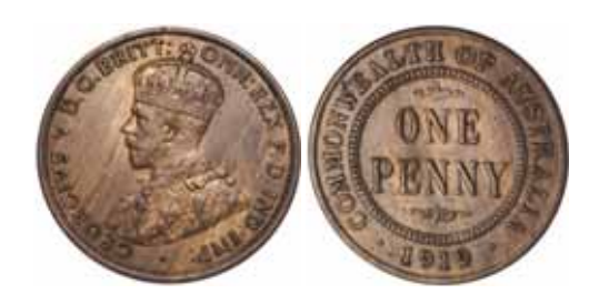
1667* George V , 1919 double dot, dot above top scroll and below lower scroll. Streaky red and brown patina, six clear pearls

lower scroll. Streaky red and brown patina, six clear pearls and centre diamond, nearly extremely fine and excessively rare in this condition, possibly the finest known.