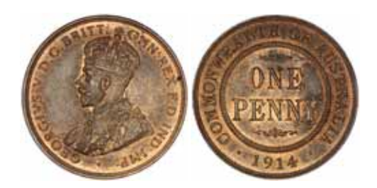
1657* George V , 1914. Well struck, red and brown uncirculated and very rare in this condition, one of the finest known. $4,000

Ex Noble Numismatics Sale 82 (lot 1440).