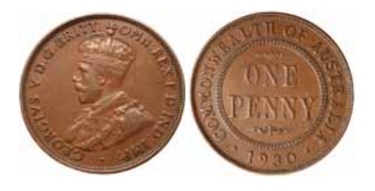
1686* George V , 1930, Indian die. Six pearls part centre diamond, nearly very fine/very fine even brown patina and better than average.