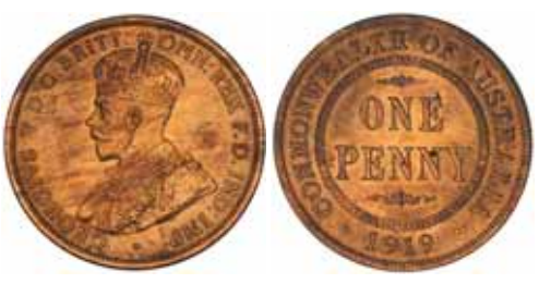
1664* George V , 1919. Nearly full original mint red, uncirculated.