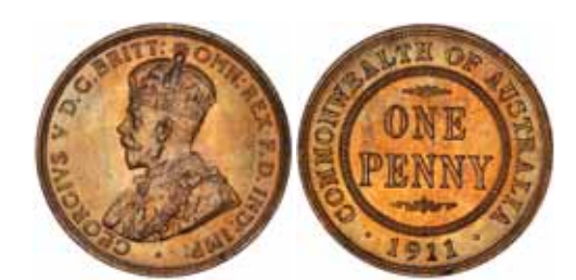
1652* George V , 1911. Full original mint red, choice uncirculated.