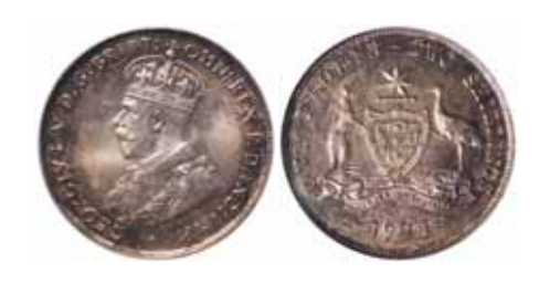
1563* George V , 1923. Well struck full original mint bloom, grey to iridescent toning, gem uncirculated and rare in this condition, one of the finest known.