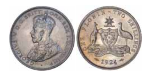
1564* George v , 1924. The 4 without serif, obverse fields brushed of deep tone, nearly uncirculated/uncirculated. $1,500