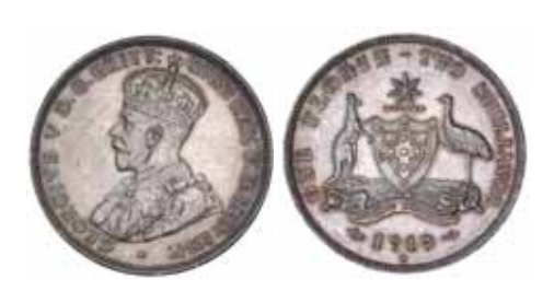
1561* George V , 1919M. Grey and golden red toned, good extremely fine/nearly uncirculated and rare in this condition.