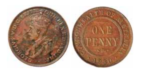
1688* George V , 1930 Indian die. Some old pitting, granular on both sides, reverse rim knock at 7 o'clock otherwise fine/good fine and rare.