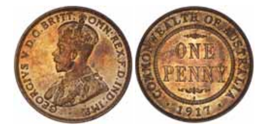
1661* George V , 1917I. Contact mark lower left and obverse field otherwise red and brown uncirculated.