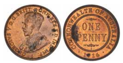
1660* George V, 1916I. Carbon spots otherwise red uncirculated. $300