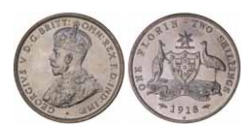
1559* George V , 1918M. Full original mint bloom, choice uncirculated, one of the finest known.

Ex\ Noble\ Numismatics\ Sale\ 89 (lot 556) and Spink Australia Sale 26 (lot 944) (G.Barraclough).