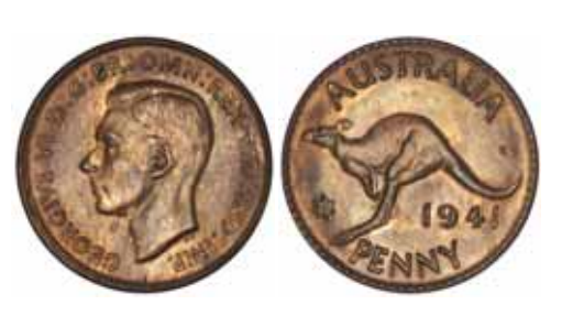
1692* George VI, 1941 K dot G. Red and brown uncirculated and scarce thus. $600