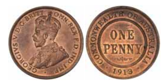
1656* George V, 1913. Red and brown, uncirculated and rare in this condition.