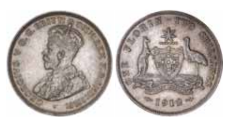
1549* George V , 1912. Nearly extremely fine.