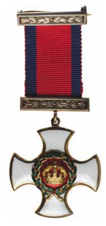
4130* Distinguished Service Order, (GVR). In Garrard & Co Ltd case of issue, uncirculated. $1,800