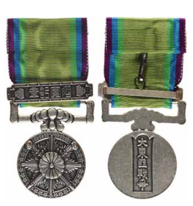
4246* Japan, Great East Asia War Medal, WWII. In black lacquered case of issue, uncirculated.

The Great East Asia War is the name used by Japan for the war in the Pacific in WWII.