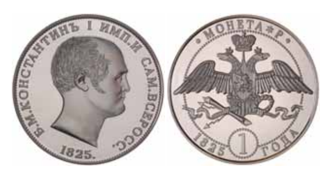
lot 4128 part (next page)

Produced in limited edition quantities by INA Ltd in 2008 to illustrate potential which had existed for the creation of a larger series of crown-sized coins for this short reign.