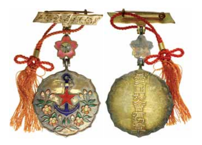
4304^{\ast} Japan, Retired Soldiers Badge, WWI and WWII, variety, in enamel and gilt. In timber case of issue, uncirculated. $80