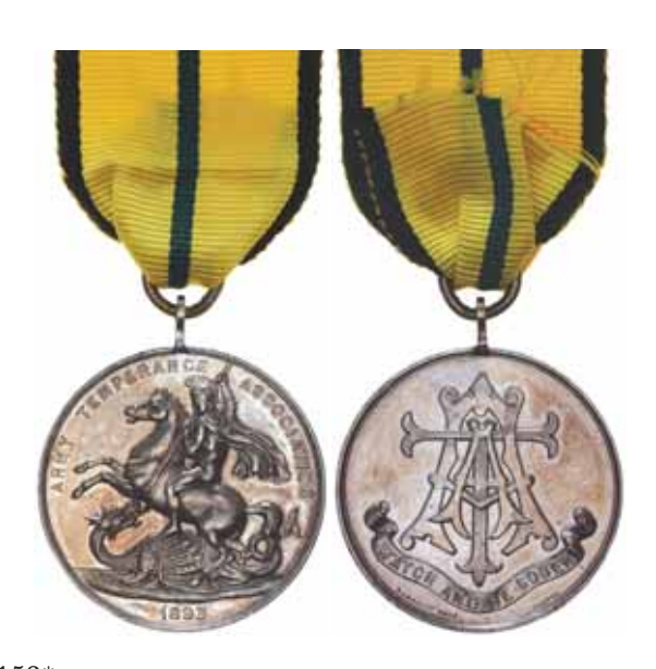
Army Temperance Association , Home Organisaton, 1893, silver medal (34mm) by Baddeley Bros. London. Incorrect ribbon, extremely fine.