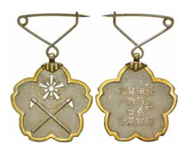
4310* Japan , Fire Fighting Association Badge, 1930. In timber case of issue, extremely fine. $80