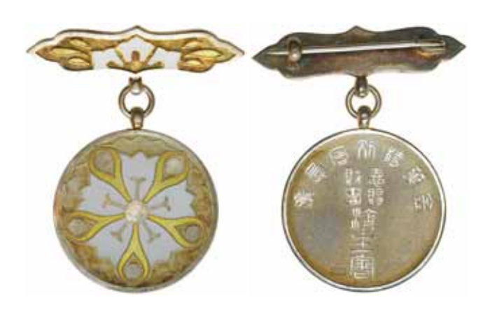
4249* Japan, Imperial Gift Foundation Social Welfare Organisation Merit Medal (white), enamelled silver. In black lacquered case of issue, uncirculated.