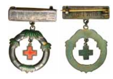
4306* Japan , Red Cross Badge in silver and enamel, WWII. In timber case of issue, uncirculated. $150