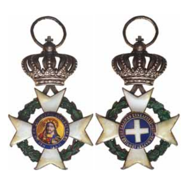
lot 4233 part

Together with German Army WWI belt buckle 'Gott Mit Uns' and an identity disc (55mm x 72mm), impressed, 'Leo Hock / Miltenberg Ufn. / 7.12.94 / 1.Ers. Batl bay. 18 J.R. / 12.K. Nr.4677', at base '859'.