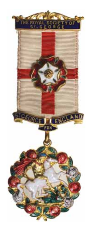
4152* The Royal Society of St George, officer's badge in gilt and enamel. Extremely fine. $150