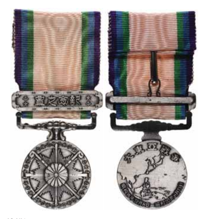
4245* Japan , veterans commemoration medal for the Great East Asia War, with accompanying lapel badge. In black lacquered case of issue, uncirculated.