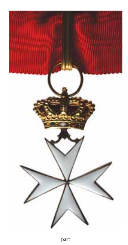
4267* Order of St John in Sweden, (Johanniterorden i Sweden), Order of Merit, neck badge in white enamel and gilt, with lapel rosette, cased. Extremely fine .