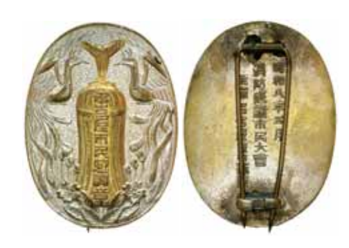
4308* Japan, Fire Department Merit Badge in silver and gilt, 1930, Nagoya Shoubon Kanshashou. In timber case of issue, nearly extremely fine. $90