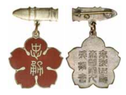
4305* Japan, Sweetheart Brooch, enamelled palonia suspended below a bullet. In timber case of issue, good very fine. $110