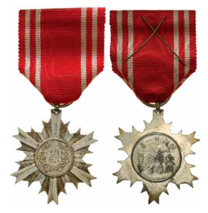
4247* Japan, Army/Navy Medal with lapel badge. In timber case of issue, extremely fine. $90