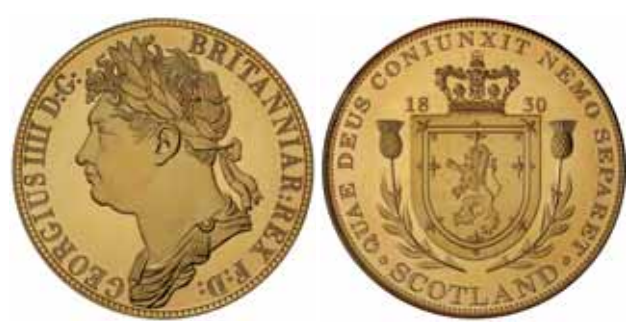
lot 4121 part

Produced in limited edition quantities by INA Ltd in 2008 to illustrate the potential which had existed for the creation of a larger series of crown-sized coins for this short reign.