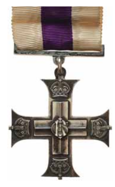
4166* Military Cross (GVR). Capt E.L.Dalkeith 56th Bn A.I.F. Engraved. With case of issue. Good very fine.