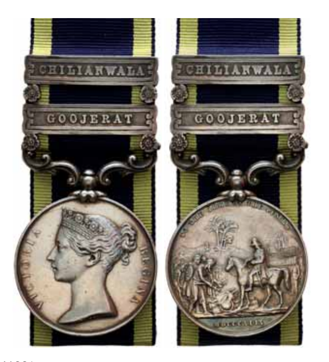
4132* Punjab Campaign Medal 1848-49 , - two clasps - Chilianwala, Goojerat. Robt.Hunt, 29th Foot. Impressed. Very fine. $1,000