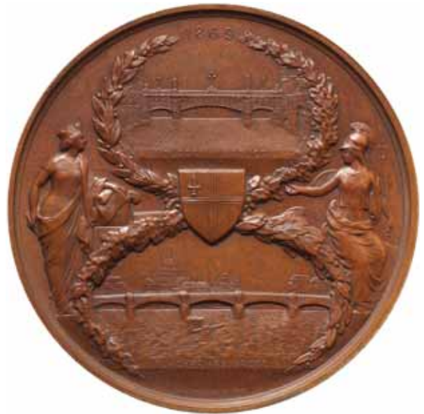
4095* Opening of Blackfriars Bridge and Holborn Valley Viaduct, 1869, in bronze (77mm) by G.G.Adams (Eimer 1604, BHM 2906). Good extremely fine.