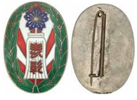
4307* Japan , Fire Department Commendation Badge in enamel. In timber case of issue, uncirculated. $70