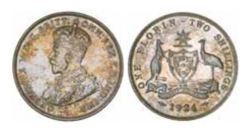
1515* George V, 1924. Golden tone, good extremely fine/nearly uncirculated.