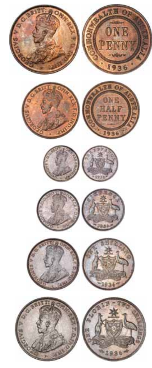
1493* George V, year set, 1936, florin to halfpenny. Well struck, toned, nearly uncirculated - uncirculated. (6) $900