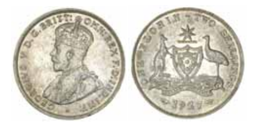
1517* George V, 1927. Nearly full original mint bloom, nearly uncirculated.