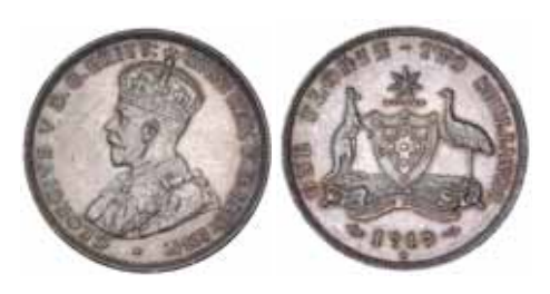
1509* George V , 1919M. Grey and golden red toned, good extremely fine/nearly uncirculated and rare in this condition. $3,000