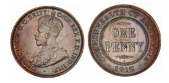
1594* George V, 1912H. Traces of red, full blue grey toned mint bloom, uncirculated. $300