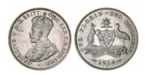
1504* George V, 1914H. Uncirculated and rare in this condition. $12,000