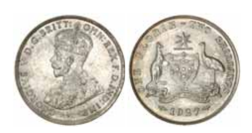
1516* George V, 1927. Full frosty mint bloom, lightly toned on the obverse, uncirculated. $750