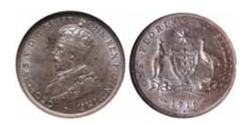
1505* George V , 1916M. Silver grey toning with mint bloom, minor surface marking otherwise nearly uncirculated.