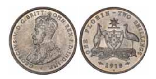
1508* George V, 1918M. Full frosty mint bloom, uncirculated. $1,000