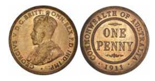
1593* George V , 1911. Full original mint red, gem uncirculated. $1,000