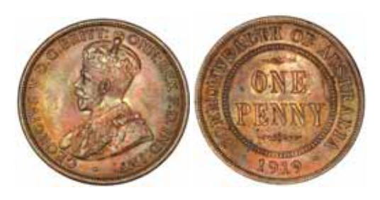
1599* George V , 1919. Dull red olive brown, uncirculated.