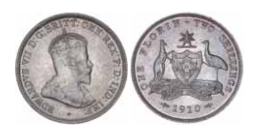
1501* Edward VIII 1010 Extremely fin

Edward VII, 1910. Extremely fine/nearly uncirculated.