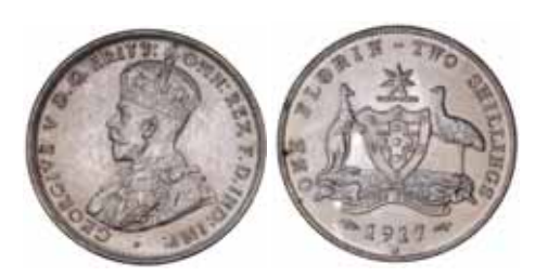
1507* George V, 1917M. Obverse scuffing otherwise considerable mint bloom, nearly uncirculated/uncirculated. $750