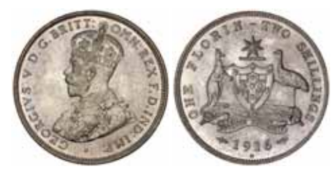
1506* George V , 1916M. Nearly uncirculated.