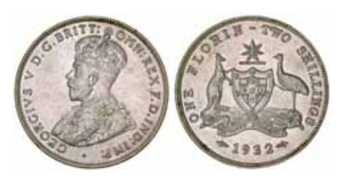
1521* George V , 1932. Some original mint bloom, nearly uncirculated and very rare in this condition. $7,500