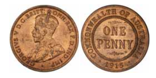
George V, 1915. Nearly full original mint red, minute rim die cud on reverse at 2 o'clock, rare in this condition, one of the finest known. $6,000