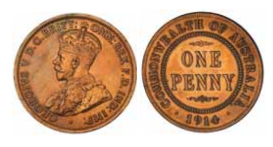
1595* George V, 1914. Cleaned otherwise nearly uncirculated. $250