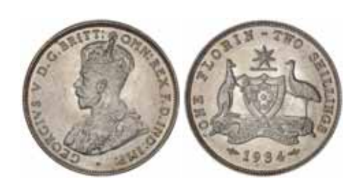
1522* George V , 1934. Full original mint bloom, nearly choice uncirculated. $1,000