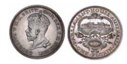
1518* George V, 1927 Canberra. Attractive tone, uncirculated. $100

1519 George V, 1928. Good extremely fine.