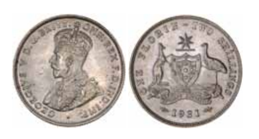
1520* George V, 1931. Uncirculated with near proof-like fields. $350