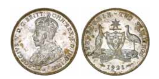
1511* George V , 1921. Full original cartwheeling mint bloom, minor yellow brown rust toning, otherwise choice uncirculated and rare thus. $3,000