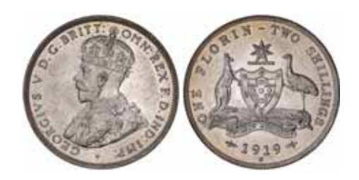
1510* George V , 1919M. Considerable mint bloom, nearly uncirculated and rare in this condition. $2,000