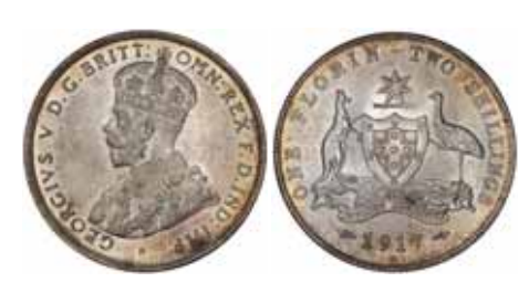
593* George V, 1917M. Good extremely fine.