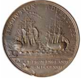
George III, Resolution and Adventure Medal, 1772, in platina (brass) (42.5mm) by J.Westwood for Matthew Boulton for Sir Joseph Banks, struck from the first (or cracked) die, axis upright or en medaille, obverse signed B:F (Boulton fecit?) (MH 373, BHM 165, Eimer 744, Klenman 1). Rim drilled at top for wear, suspension ring missing, good very fine and rare.