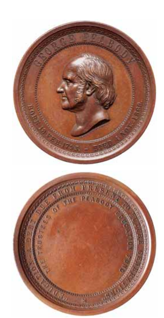
666* U.S.A., George Peabody 1869, in bronze (64mm) by Henry Mitchell. Extremely fine. $250

Barnum Museum was very historic and located in lower Manhattan at B'way & Park Row (across from St. Paul's, near City Hall). The interesting obverse inscription reads: "This immense establishment contains 500,000 curiousities, including birds, beasts, insects, fossils, minerals, marine specimens, Indian implements, suits of armour, statuary, medals, coins, paintings, rare engravings, Grand cosmorama, Aerial Garden & Lecture room in which rich, diversified and talented entertainments are given, unsurpassed in the world. Admission to the whole 25 cents" This museum was known to contain choice exotic Polynesian and other Oceanic artifacts. Rulau.NYNY11.