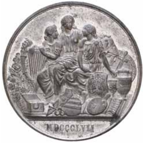
664* Great Britain, Manchester Art Treasures Exhibition 1857 in white metal (63mm) by Pinches & Co. In original decoratively embossed brass case, extremely fine.