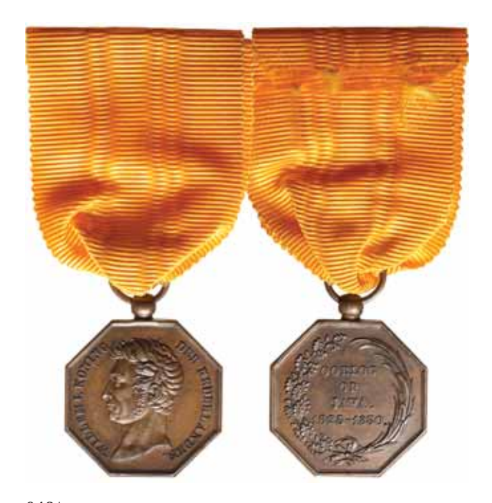
642* Netherlands East Indies, Java War (1825-30), in bronze (octagonal, 29mm), with ring top suspension and ribbon. Extremely fine.