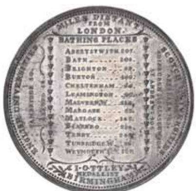
lot 656 part (following page)