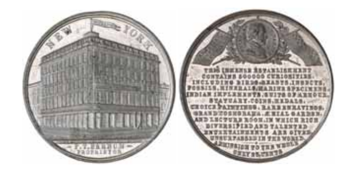
U.S.A., P.T. Barnum's American Museum, New York 1862, in white metal (38mm). Nearly uncirculated.

Commemorates the "Exhibition of Our Treasures opened at Manchester by His Royal Highness Prince Albert, May 5, 1857". This exhibition included native manufactured items from the Pacific Islands.