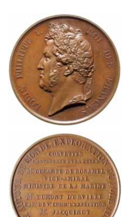
644* D'Urville, Dumont, cruise of Astrolabe and La Zelee 1837, in bronze (50mm) by Barre (M.H.-). Attractive medium brown patina, uncirculated.

Ex Noble Numismatics Sale 82 (lot 966). This voyage included discovery of the remains of La Perouse's expedition.