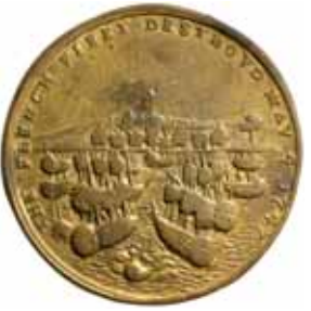
611* Lord Anson , London, 1747 in brass (37.2mm)(MI CLXXI/7). Wear on high points, otherwise nearly very fine. $800

Ex\ John\ J. Ford, Jr. Collection, part 14, Stack's, May, 2006 (Lot 452, with their ticket).