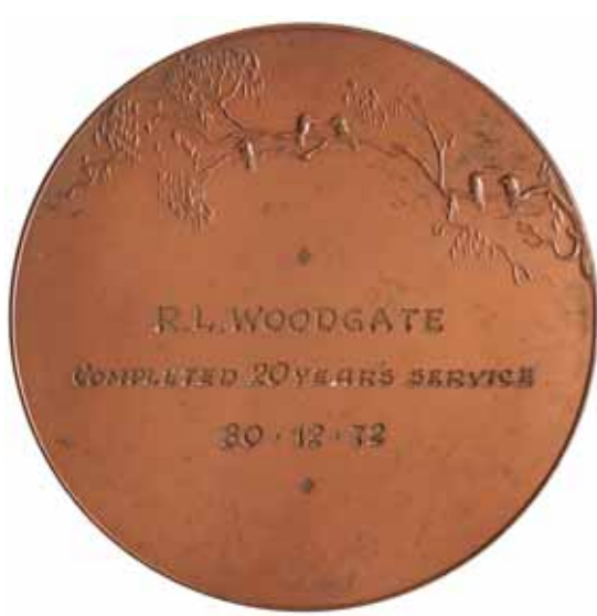
lot 748 part