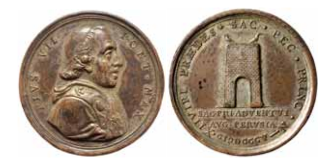
631* Pope Pius VII, at Perouse 1805, in bronze (38mm). Has been silvered at some time, very fine and rare.