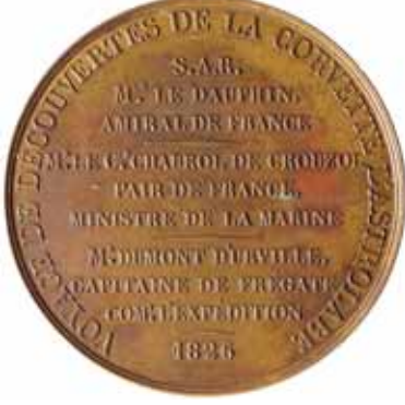
643* D'Urville, Dumont, Voyages of the Astrolable, 1826, in bronze (50mm) by Depaulis (M.H.190). Attractive red brown patina, nearly uncirculated. $2,000

Ex Noble Numismatics Sale 82 (lot 966). This voyage included discovery of the remains of La Perouse's expedition.