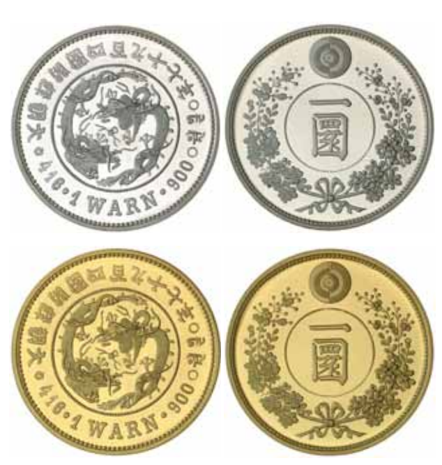
Lot 2220 part

India, George V, fifteen rupees, 1918, Bombay mint, (Pr.25, KM.525). Extremely fine.