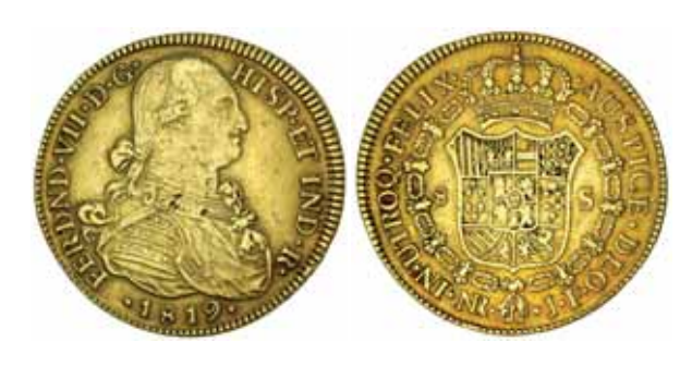
2185* Colombia, Ferdinand VII, eight escudos 1819 JF, NR (Nuevo Reino) with bust of Charles IIII (KM.66.1). Nearly very fine.