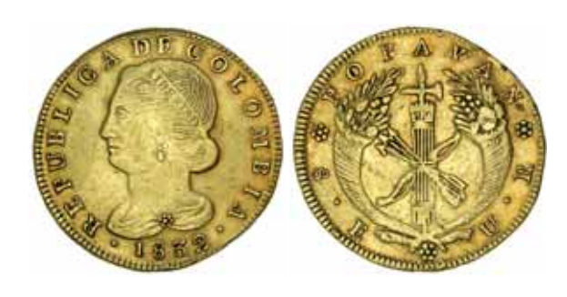
2186* Colombia , Republic, eight escudos 1832 U.R., Popayan (KM.82.2). Nearly very fine. $800

2187 Czechoslovakia, one ducat, 1933 (KM.8). Nearly uncirculated.