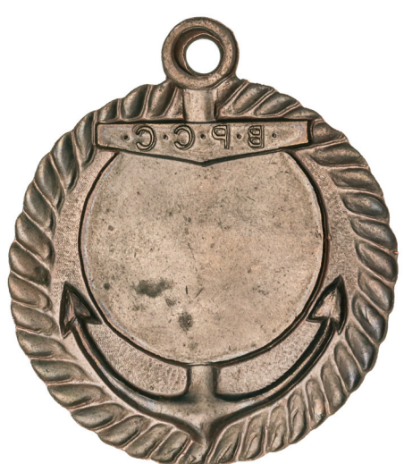
3635* B.P.C.C. (Banks Penninsula Cruising Club), struck in copper (65x55mm), ring top suspension, obverse inscribed 'Little Akaloa/To/Lyttelton/"Paora"/1961-62'. Very fine.