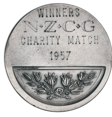
3663* N.Z.C.G (probably New Zealand College Games), 1957, struck in silver (48mm), by K.J.Luke (Melbourne), reverse inscribed 'Winners/N.Z.C.G/Charity Match/1957'. Extremely fine.