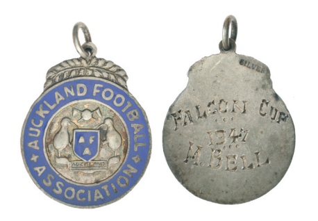
3657* Auckland Football Association, 1947, fob medal, uniface, struck in silver and blue enamel (28mm), no maker, ring top suspension, reverse inscribed 'Falcon Cup/1947/M.Bell'. Very fine .