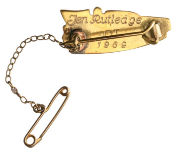
3636* NZ 100 MPH Club, badge struck in gold (9ct, 3.8g, 28x13mm) and black enamel, no maker, pin-back with safety

28x13mm) and black enamel, no maker, pin-back with safety chain, reverse inscribed 'Jen Rutledge/1969'. Extremely fine.