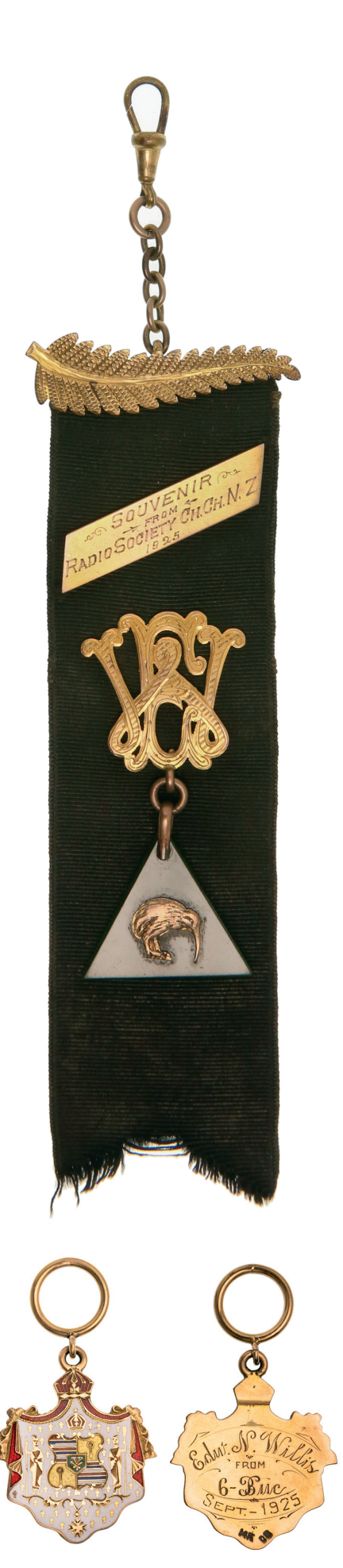
lot 2536 part

Radio Society, Ch.Ch., 1925, souvenir decorated cloth fob drop, consisting of gold (9ct) fernleaf at top, gold (9ct) inscribed panel, copperplate initials 'E.N.W.' in gold (9ct), fob with a gold (9ct) kiwi on greenstone attached, suspended with rolled gold chain and fob clip at top; Hawaii, coat of arms, fob medal in gold (14ct, 6.4g, 30x28mm) and enamel, ring top suspension, reverse inscribed 'Edw.N.Willis/From/6 Buc/Sept 1925'; also, N.Z.R.L. kiwi coat pin in silver (20x18mm). Very fine . (3)