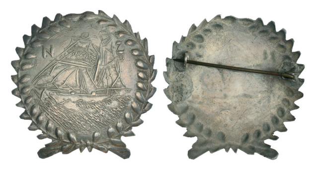
2575* NZ badge , c1940s, sailing ship, handcrafted in silver (38mm), pin-back. Very fine .