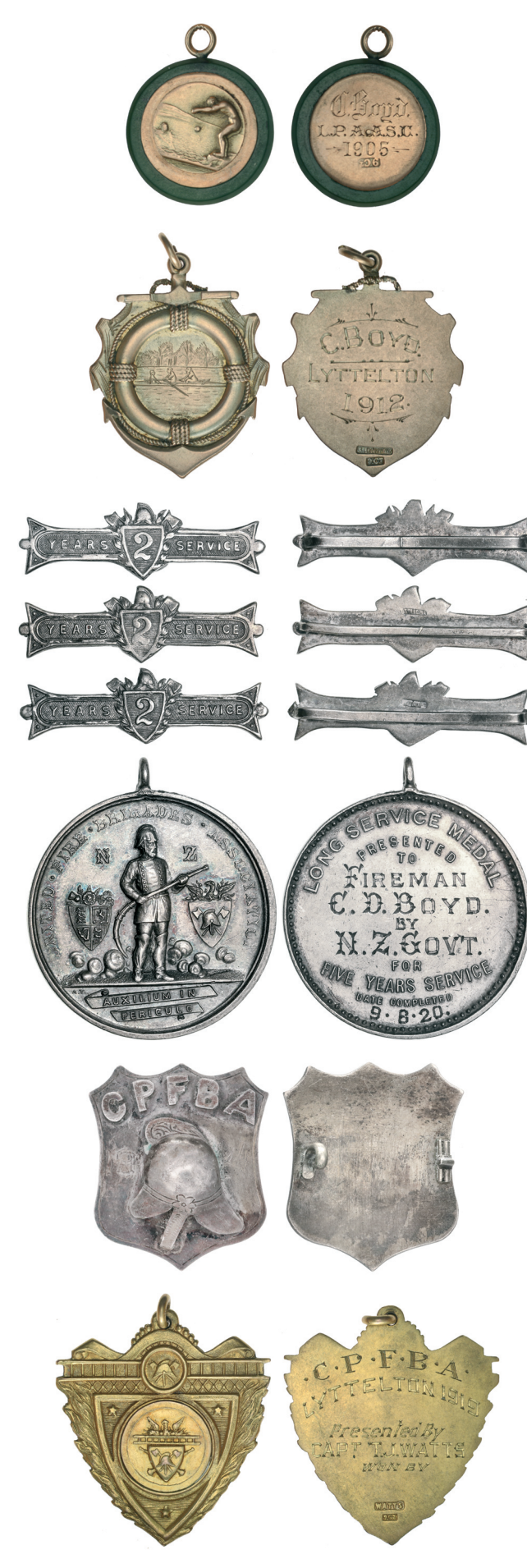
lot 2449 part