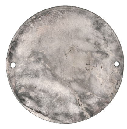
2451* Christchurch, silver and enamel plaque (51mm), c1906, no maker, enamelled centre shield featuring Cathedral Square, pierced either side for attachment. Very fine .