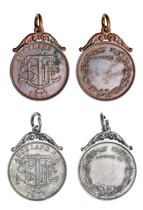
2489* T.U.S.E., 1911, struck in bronze (32x26mm), by Alf. M.Skeates (Auckland), ring top suspension, uninscribed. Very fine .