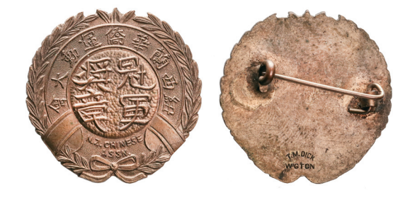
2576* N.Z. Chinese Assn, c1940s, badge, struck in copper (31mm), by T.M.Dick, Wellington, pin-back. Extremely fine .