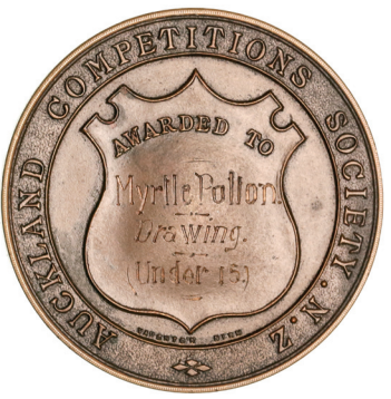
2491* Auckland Competitions Society NZ, (1912), struck in bronze (44mm) by Vaughton, Birmingham, reverse inscribed 'Myrtle Polton/Drawing/(Under 15)'. Good extremely fine .