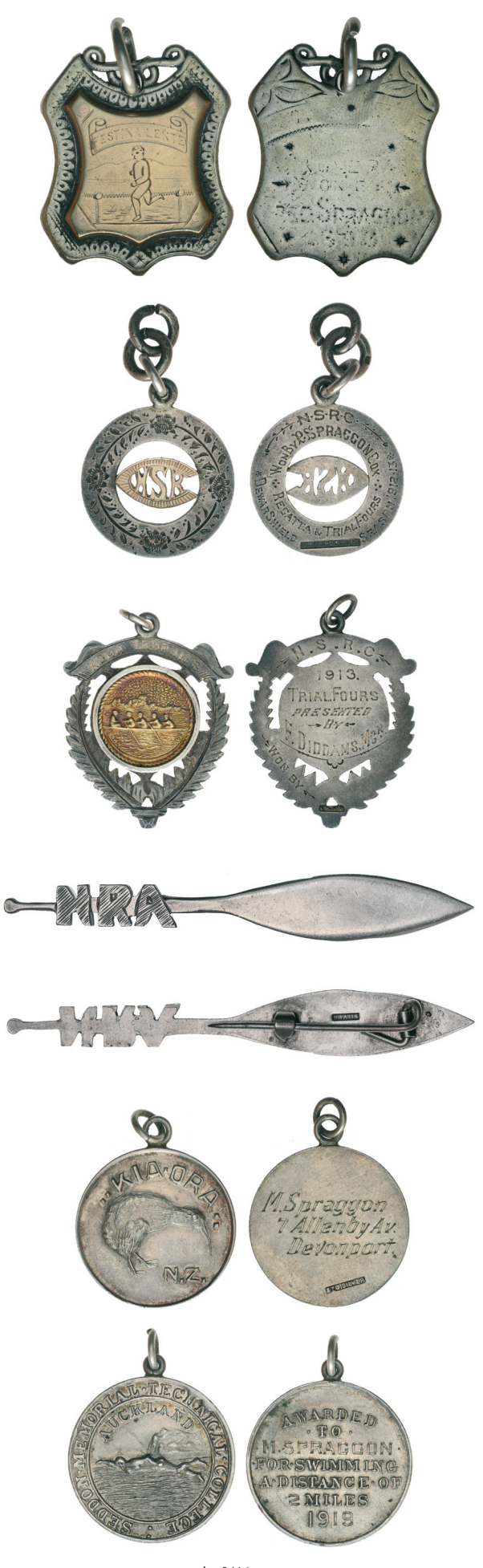
lot 2416 part