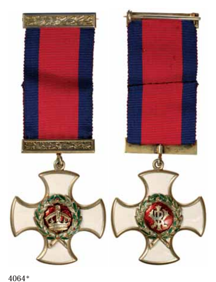
Distinguished Service Order (VR), in silver gilt. Very fine. $1,750

4065 Military Cross (GVIR) (GRI). Extremely fine.