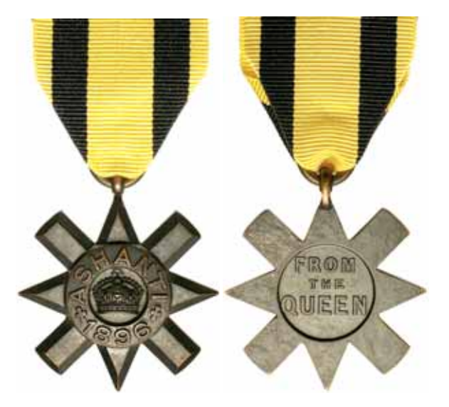
4111* Ashanti Star 1896, unnamed. Extremely fine.