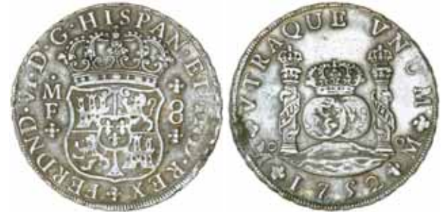
3893* Mexico , Ferdinand VI, silver 'pillar' type eight reales, 1752 M.F., Mexico City Mint (KM.104.1). Lightly toned, good very fine.