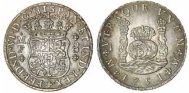
3891* Mexico , Ferdinand VI, silver 'pillar' type eight reales, 1751 M.F. (KM.104.1). Minor striation lines on the obverse, otherwise nearly uncirculated with a delightful golden peripheral tone.