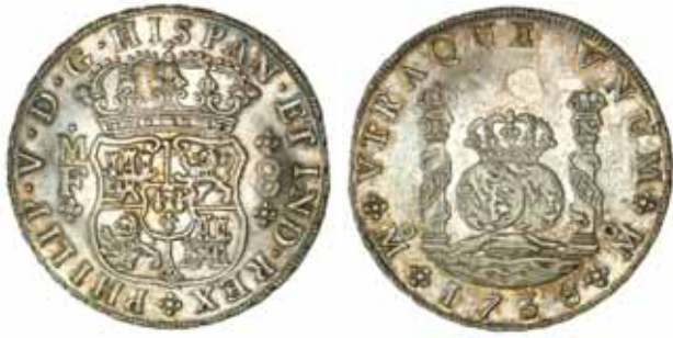
3887* Mexico , Philip V, silver 'pillar' type eight reales, 1738 M.F., Mexico City Mint (KM.103). With mint bloom, nearly uncirculated and rare in this condition.