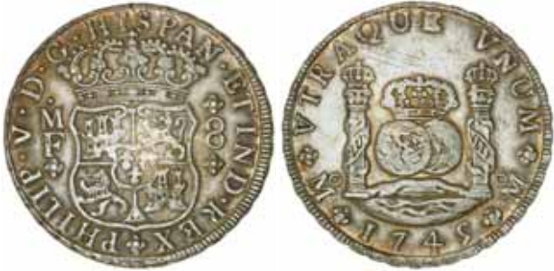
3889* Mexico , Philip V, silver 'pillar' type eight reales, 1745 M.F., Mexico City Mint (KM.103). Lightly toned, light surface scatches, good very fine.