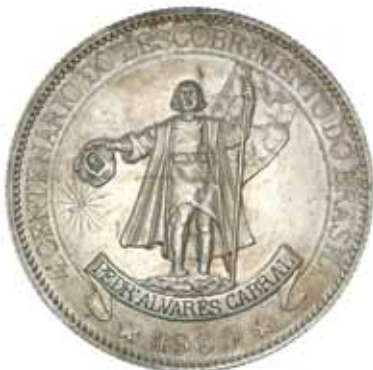
Lot 3750 obverse