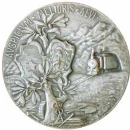
(obverse only) part