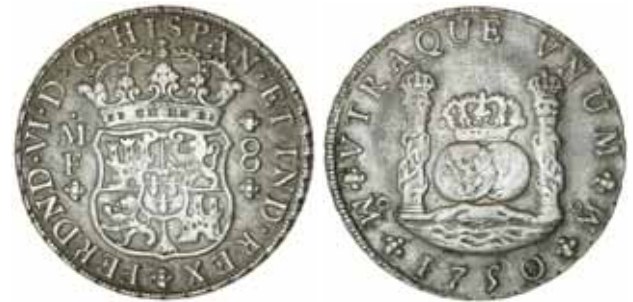
3892* Mexico , Ferdinand VI, silver 'pillar' type eight reales, 1750 M.F., Mexico City Mint (KM.104.1). Lightly toned, very fine.