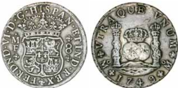
3890* Mexico , Ferdinand VI, silver 'pillar' type eight reales, 1749 M.F., Mexico City Mint (KM.104.1). Lightly toned, very fine.