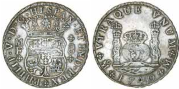
3888* Mexico , Philip V, silver 'pillar' type eight reales, 1740 M.F., Mexico City Mint (KM.103). Lightly toned, surface scatches, very fine.