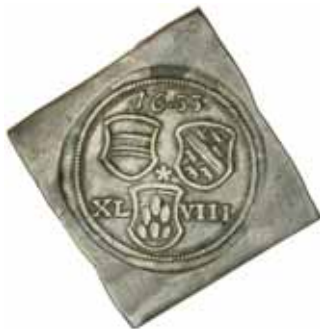
Lot 3718 obverse

Ex Spink Coin Auctions, 15th May 1981 (lot 417, illustrated). The bishopric of Minden was besieged during the Thirty Years' War by Georg, Duke of Brunswick-Luneburg, who was in league with the invading forces of Sweden as they swept in from the north. After the war, Minden was stripped of its ecclesiastical role and given to Brandenburg in the Peace of Westphalia.