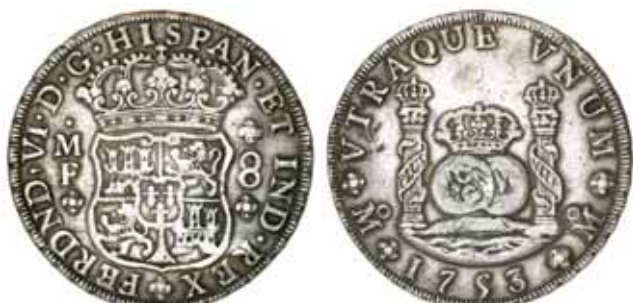
3894* Mexico , Ferdinand VI, silver 'pillar' type eight reales, 1753 M.F. (KM.104.1). Very fine or better.