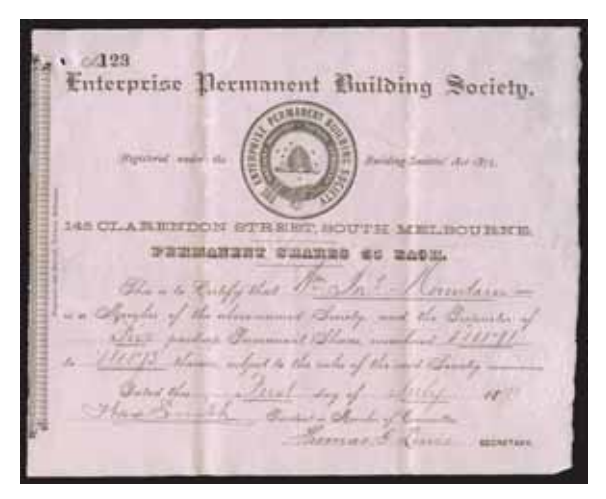
Lot 655 part