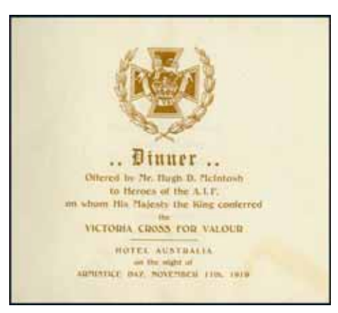
Lot 5067 part