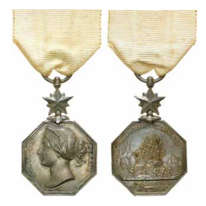
4974* Arctic Medal 1857 , unnamed as issued. Very fine.