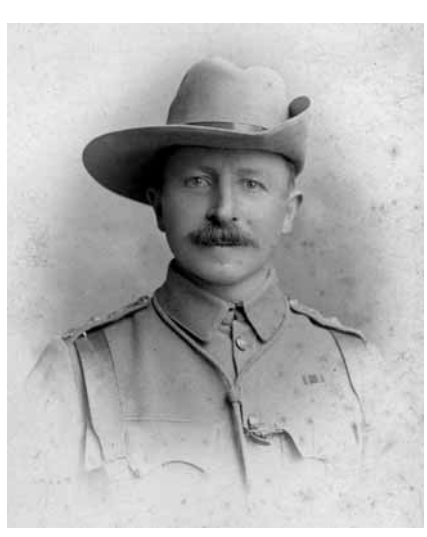
Lot 4988 part