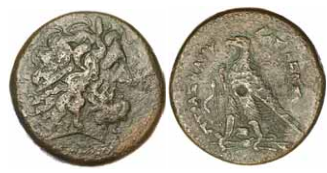
Egypt , Kingdom of, Ptolemy IV, (221-204 B.C.), AE 40, drachm, (63.0 grams), Alexandria mint, obv. diademed head of Zeus Ammon to right, rev. eagle to left with closed wings, standing on thunderbolt, cornucopiae over shoulder, around ΠΤΟΛΕΜΑΙΟΥ ΒΑΣΙΛΕΩΣ, between legs ΣΕ, dotted border, (S.7814, Sv. 992, BMC 69-71, SNG Cop. 205-6, Pitchfork 35-36, Koln 61 [attributes issue to Ptolemy III between 247-243 B.C.). About very fine, some surface roughness, scarce.