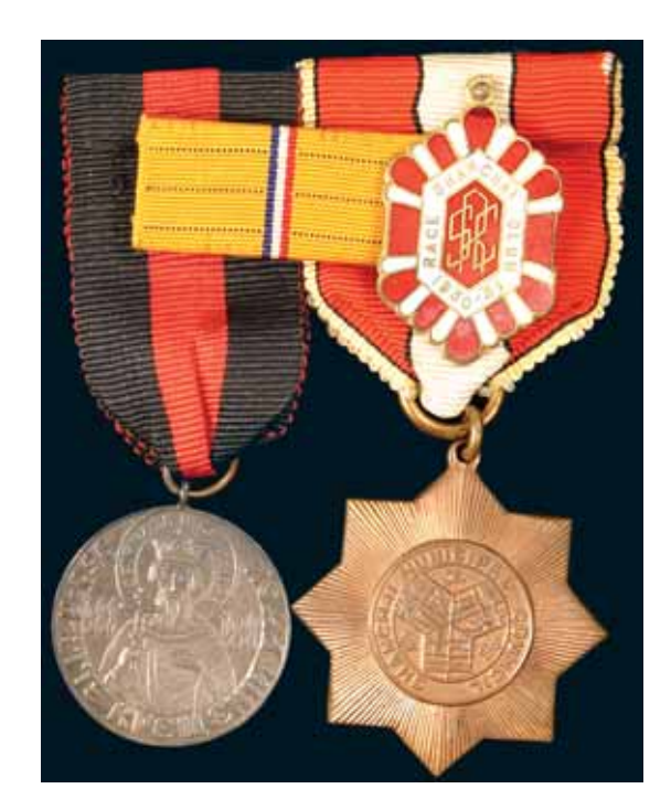
5441* Shanghai Municipal Council Emergency Medal 1937. Unnamed. Very fine.