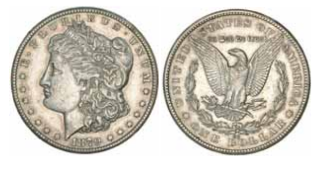
2849* U.S.A., Morgan dollar, 1879CC. Very fine.