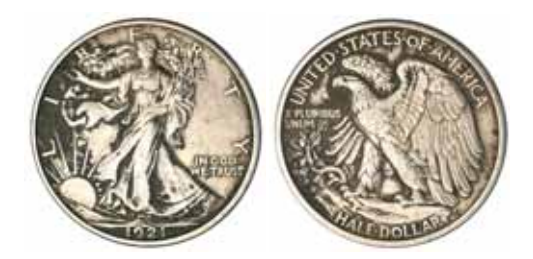
U.S.A. , Liberty walking half dollar, 1921 S. Dark grime in fields, otherwise good very fine and scarce. $500