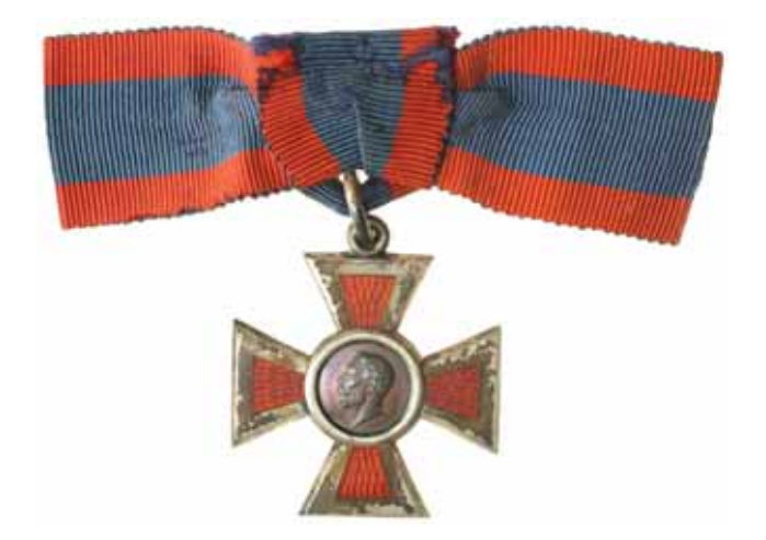
3888* Royal Red Cross. ARRC (GVR). Very fine.