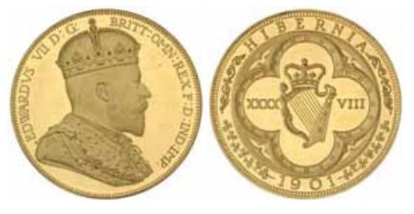
Lot 1899 part