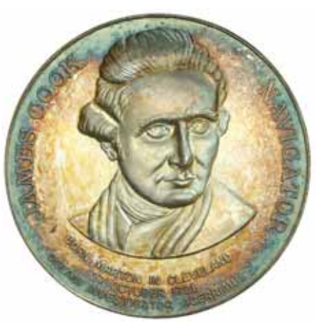
Lot 990 obverse

Captain Cook , medallions by Gravarte Lisbon, Portugal in silver (70mm) and large (40mm) (K.87A & B). M.C.C Sydney 1988 oval medallion with Gov. Phillip's portrait in bronze (55 x 72mm) only fifty minted of the first. Uncirculated . (3) $100