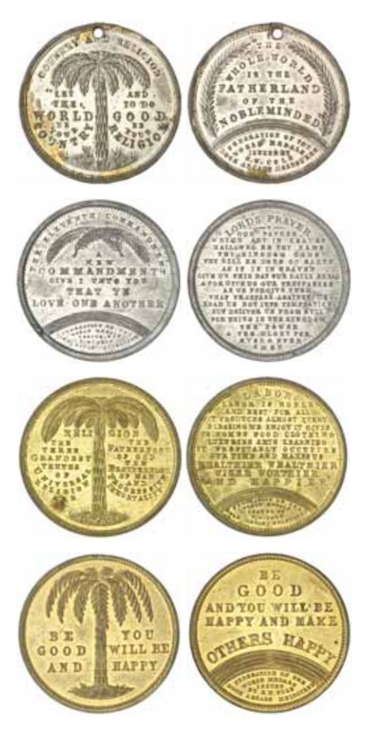
Coles medals , as per Dean numbers 2, 4, 7, 14, 17(2), 19 (2 thicknesses, 1.5 & 2mm), 22, 24, 28, 29, 31, 32, 38, 40(2), 41 (nickel) 42, all in 2 x2 holders and described (D.28, 17 illustrated). Fine - good extremely fine, some scarce to rare varieties. (19)