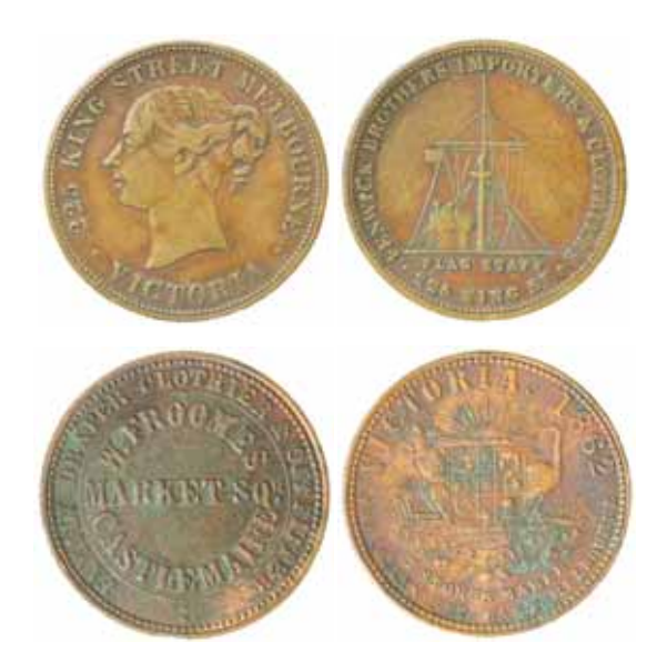
Lot 1030 part