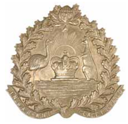
Lot 3713 part

Ex Major E.J.Millett MBE Collection (Sale 55a, lot 142).