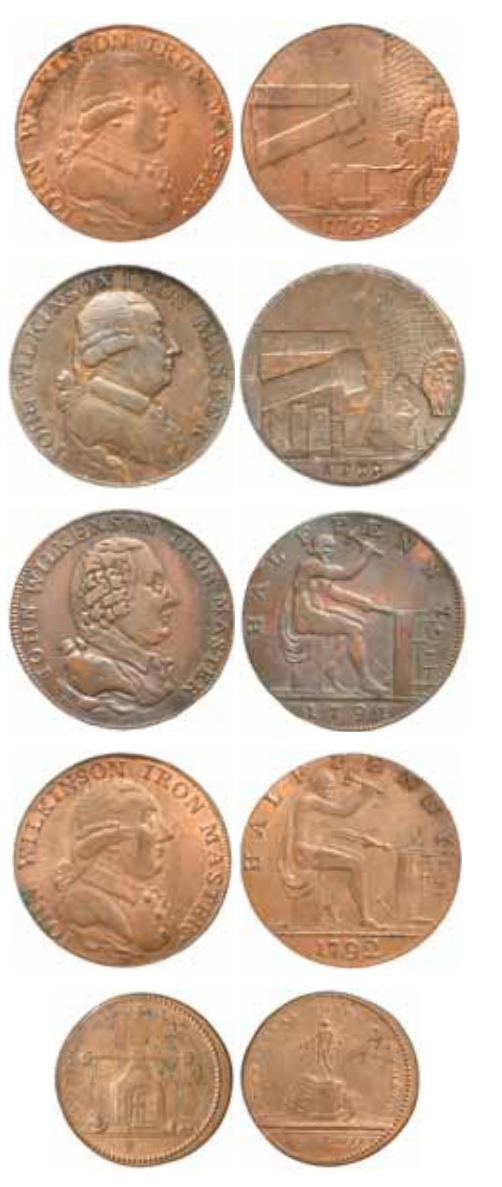
Lot 2195 part