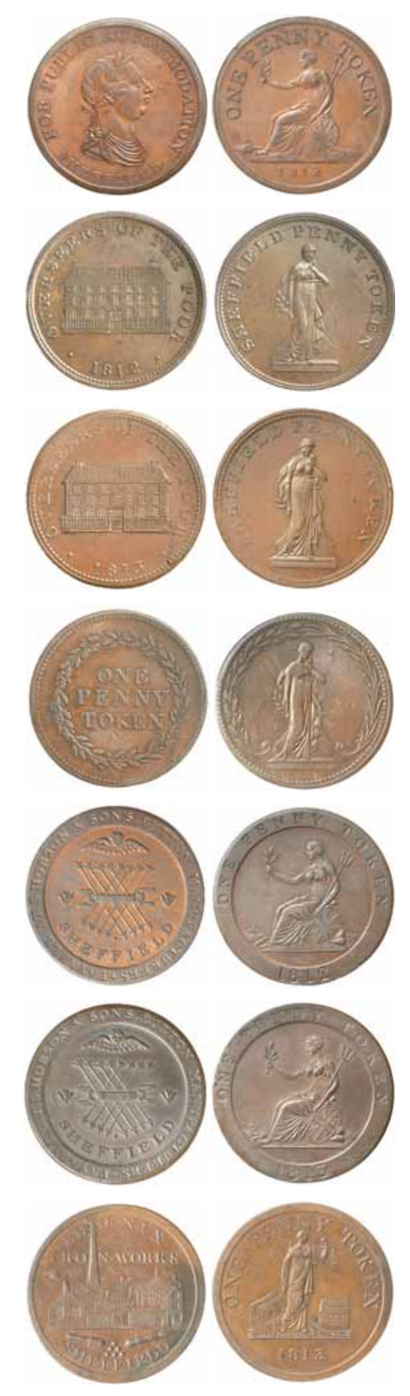
Lot 2214 part (following page)

Ex W.J. Noble Collection, Noble Numismatics Sale 58 (lot 1942). The second ex Padre Bremer Collection, next three with the first from Spink in 1975, last from Dolphin Coins in 1987.