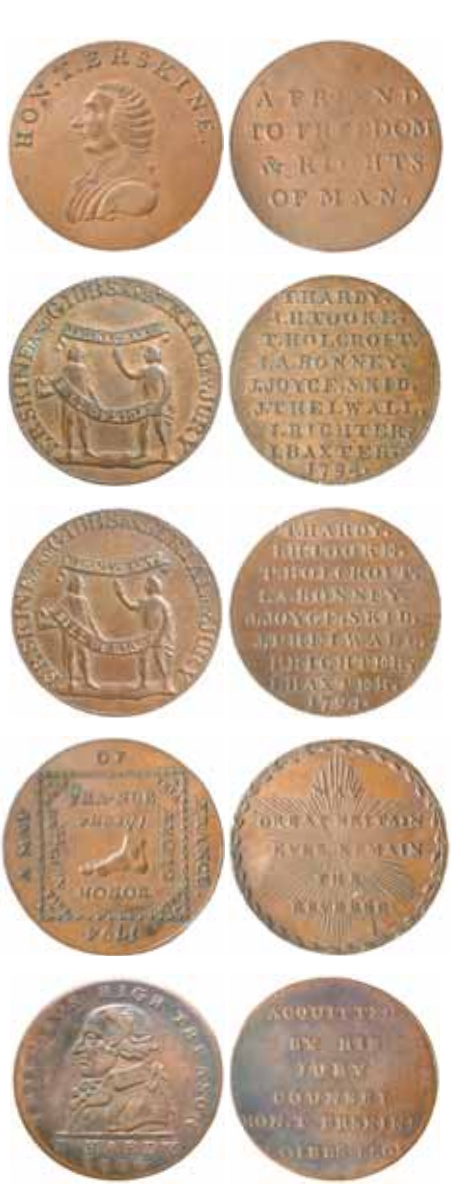
Lot 2181 part