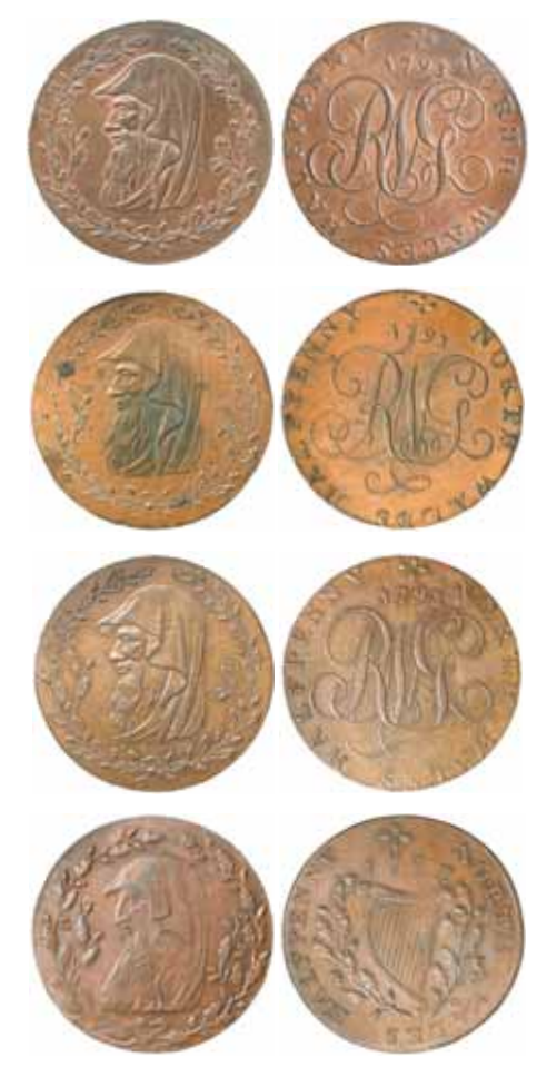
Lot 2197 part

Yorkshire , Huddersfield, Downings halfpenny 1793 (D&H 15); Hull, Gorton's halfpenny, 1791 (D&H 21), mule sailing ship (D&H 23); Leeds, Brownbill's halfpennies, 1793 (D&H 33, 34 [illust.], 36, 41); Paley's halfpennies, 1791 (D&H 43, 46, 48, 52, 55); Shelffield, Hand's halfpennies, 1793 (D&H 56b), 1794 (D&H 57, 59 [2]); York, Cattle, Harrison & Co's halfpenny, 1795 (D&H 63 [2]). Good fine - good extremely fine. (18)