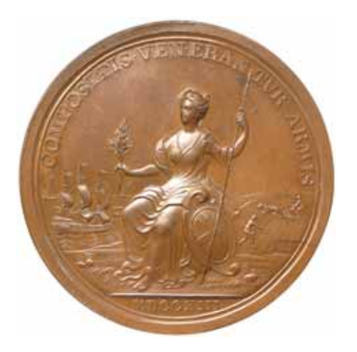
Anne , The Peace of Utrecht, in bronze (59mm) by John Crocker (M.I.399/256; Eimer 458). Lacquered choclate bronze patina, nearly uncirculated.