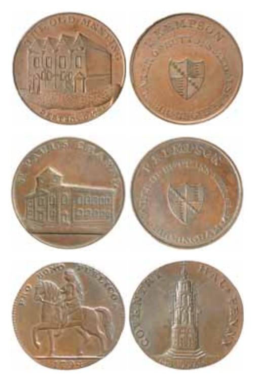
Lot 2194 part (following page)

Warwickshire, County issues, Shakespeare halfpennies (D&H 45, 46); Birmingham, halfpennies, boy with tools, 1793 (D&H 50, 50h [illust.]); Birmingham, Allin's halfpenny, 1796 (D&H 62), (illust.]; Biggs' halfpenny 1792 (D&H 70 [2, one illust.], 71a); Birmingham Mining and Copper Company halfpennies (D&H 75c, 82, 88 [2, one illust.], 95 [illust.], 103, 108b, 113); Bisset's halfpenny (D&H 120 [but tooled to appear as a 119] illust.); Hickman's halfpennies 1792 (D&H 144, [2, one illust.]). Fine - extremely fine or better . (20)