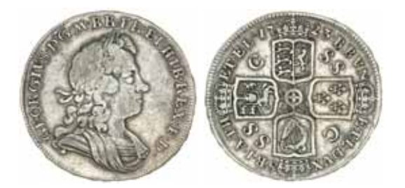
George I, silver halfcrown, 1723 SSC issue, (S.3643, ESC 592 [S]). Lightly toned, fine/very fine and very scarce.