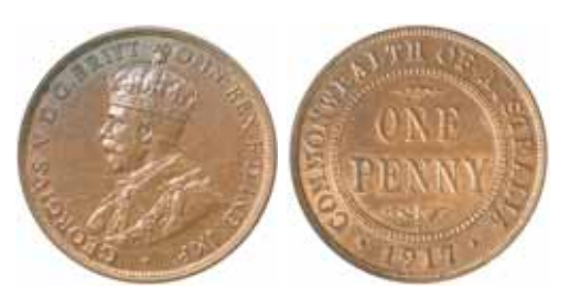
1444* George V, 1917I. Brown and red, uncirculated.