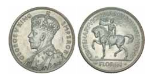
1357* George V , 1934-35 Melbourne Centenary. Well struck frosty mint bloom, uncirculated with Foy's bag (very fine).