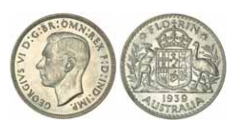
1362* George VI, 1939. Extremely fine.