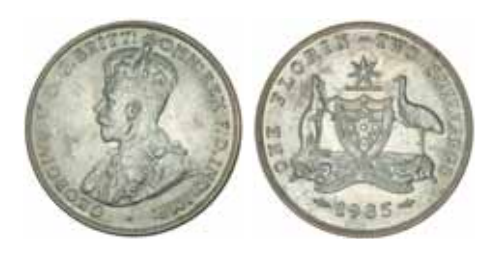
1359* George V, 1935. Nearly full original mint bloom, uncirculated.

Purchased by the owner in Perth in 1961.