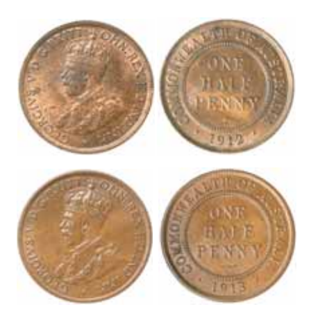
1484* George V, 1912H and 1913. Mostly brown, nearly uncirculated. (2) $350