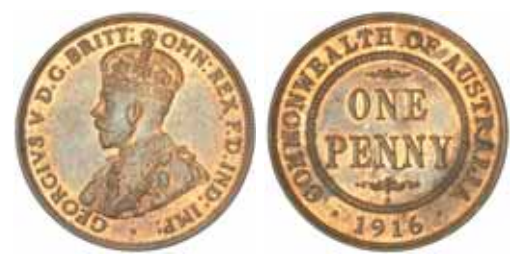
George V, 1916I. Red and brown uncirculated.