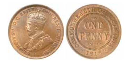
1441* George V, 1915. Brown and red, nearly uncirculated and rare in this condition.