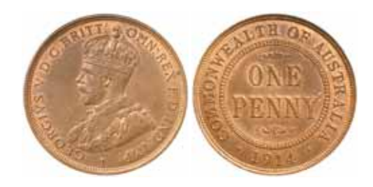
1440* George V, 1914. Red and brown uncirculated and rare in this condition.