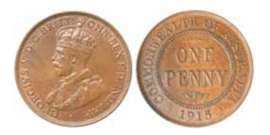
George V, 1915H. Toned even brown and well struck good extremely fine.