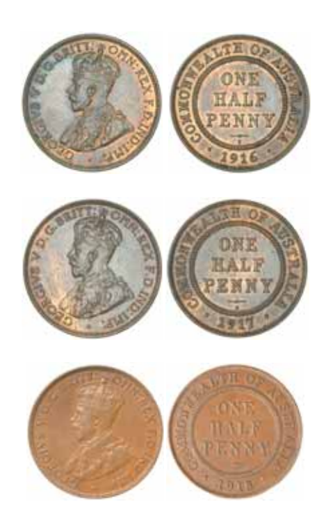
1491* George V, 1916I, 1917I and 1918I. The last good very fine, the others brown and red, nearly uncirculated. (3)