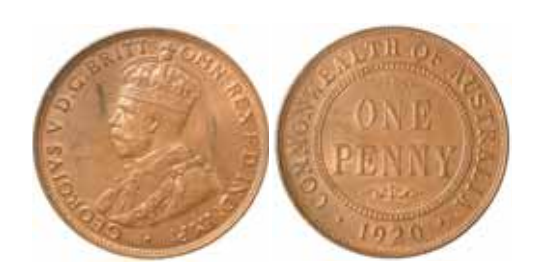
George V, 1920 dot below, Indian die. Nearly full original mint bloom, lightly toned, choice uncirculated and rare in this condition.