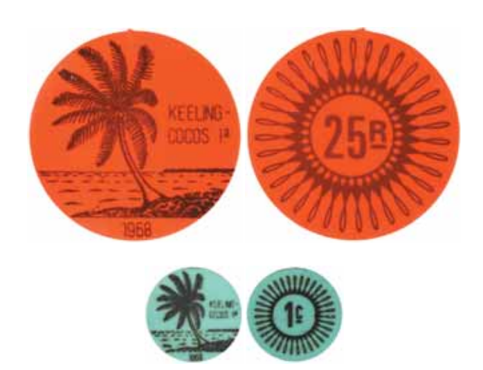
Lot 889 (part)

1968, for one, five, ten, twenty five and fifty cents (all green)one, two, five, ten and twenty five rupees (all red). Extremely fine and rare. (10)