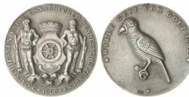
1777* Germany , Shooting Festival medal in .900 fine silver (39mm), Osnabruck 1926. Extremely fine .