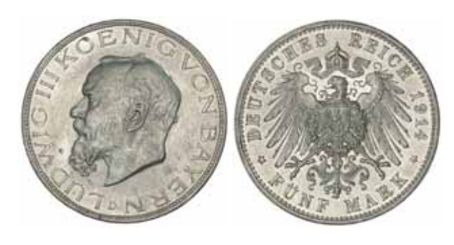
1744* Germany, Baden, Ludwig III, silver five marks 1914D, (KM.281, D.538). Extremely fine .