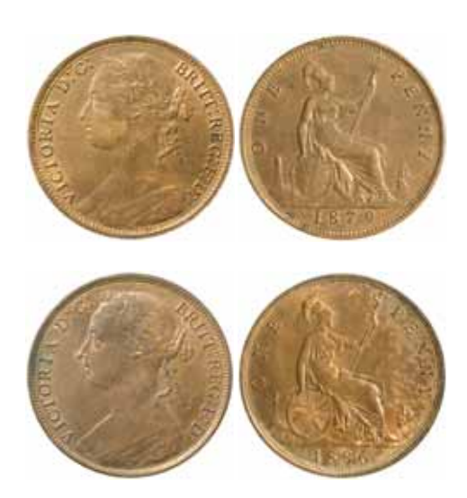
1861* Queen Victoria, bronze pennies, 1879, 1886 (S.3954). Nearly full mint red, good extremely fine - uncirculated. (2) $250