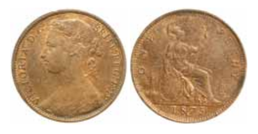
1860* Queen Victoria , bronze penny, 1875H (S.3955). Spotty and lightly pitted with some mint red, extremely fine and rare. $200