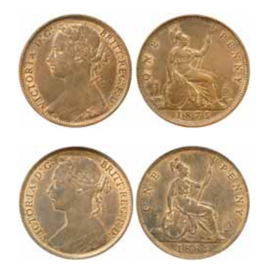
1859* Queen Victoria, bronze pennies, 1875, 1884 (S.3954). Partial mint red, extremely fine - uncirculated. (2)