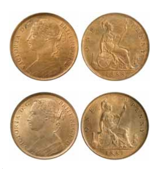
1862* Queen Victoria , bronze pennies, 1888, 1881H (S.3954, 3955). Both about full mint red, good extremely fine -uncirculated. (2) $250