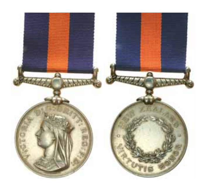
2108* New Zealand War Medal, undated. 456 R Speck A H Corps. Impressed. Very fine. $2,000

With details of service and copy roll entries.