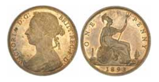
1863* Queen Victoria , bronze penny, 1893 (S.3954). Mostly full original mint red, uncirculated. $150