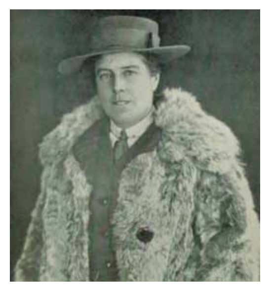
Lot 2117 part