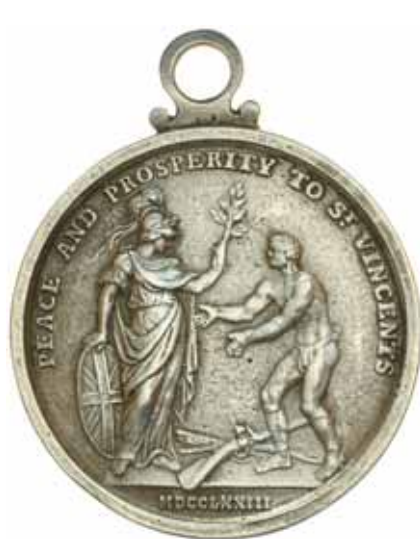
2018* Carib War Medal , 1773, George III, in silver (54mm) cast and chased as issued with loop suspension. Good very fine and very rare.