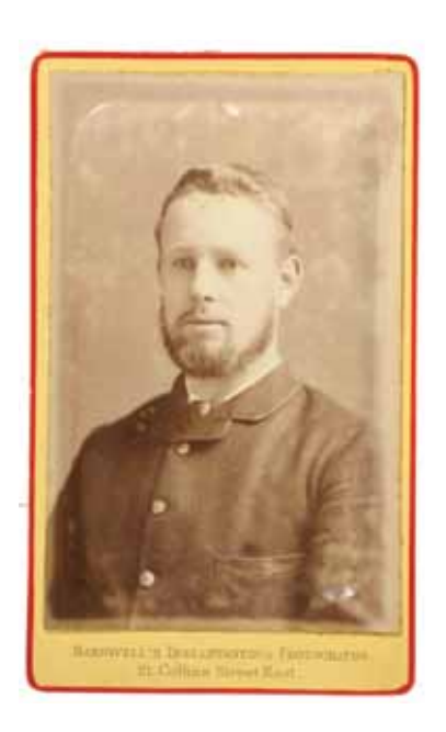
Lot 2082 part