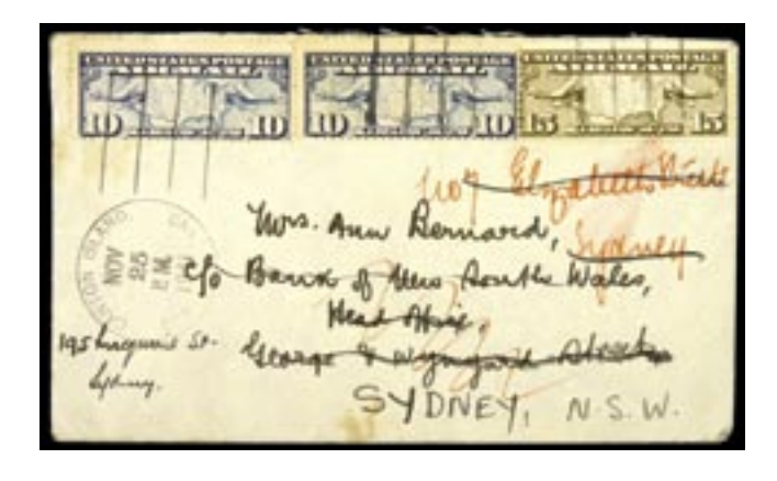
Lot 2424 (part)

Christmas Island, and Cocos Islands, incomplete collections in three Seven Seas hingeless albums, good range to 2003, nearly complete and MUH. (lot)