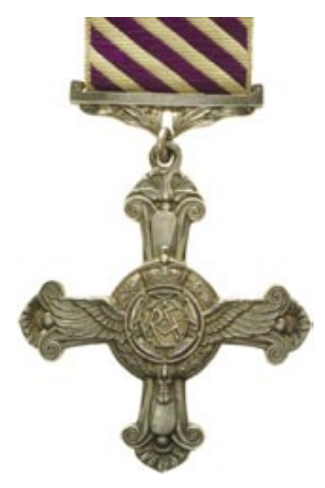
2215* Distinguished Flying Cross (GVR). Unnamed, cased. Extremely fine. $1,500