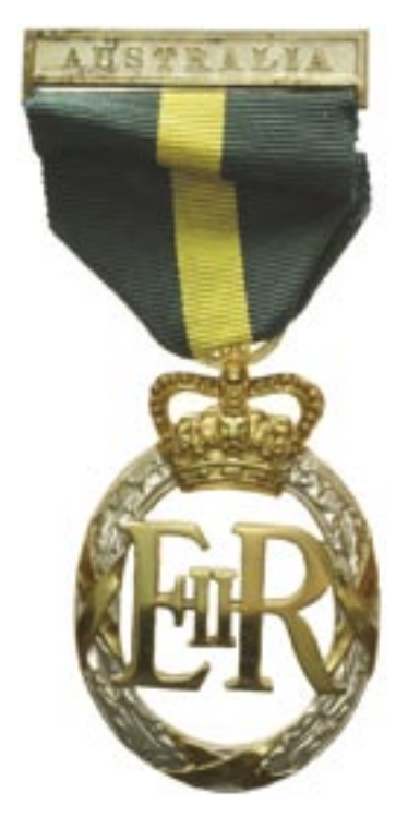
2282* Efficiency Decoration (EIIR) - Australia. 262442 J.W.Wallace. Engraved. Nearly uncirculated .