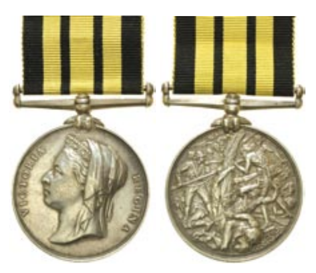
2219* Ashantee Medal 1873-74. H.S.Woolaston, Ord, H.M.S. Barracouta, 73-74. Engraved. Good very fine . $400