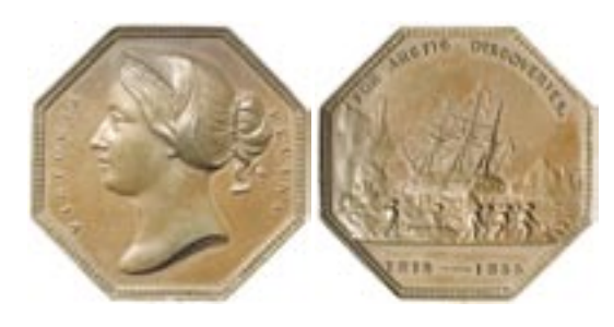
2220* Arctic Medal (VR Young Head). Specimen in bronze, unnamed. Extremely fine. $250