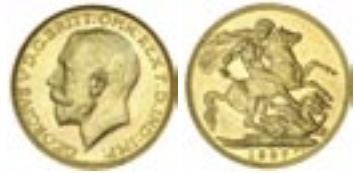
1371* George V, 1927 Perth. Nearly uncirculated. $500