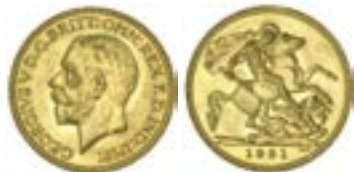
1374* George V, small head, 1931 Melbourne. Lightly toned on high points otherwise good extremely fine. $500