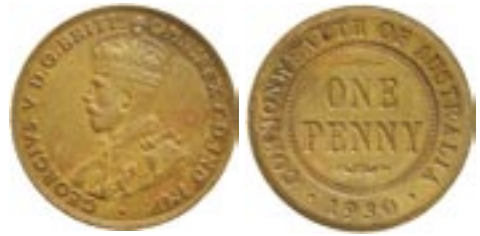
1540* George V, 1930. Almost complete centre diamond, scratch through band of crown, otherwise very fine/good very fine and rare, especially in this condition.