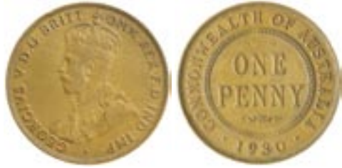
1541* George V, 1930. Tiny rim nick at 11 o'clock on obverse. Even brown patina, good fine/very fine and rare.