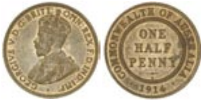
1554* George V, 1914H. Red and brown uncirculated.