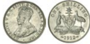
1486* George V, 1912. Nearly extremely fine.