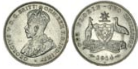
1463* George V, 1914H. Nearly extremely fine and rare.