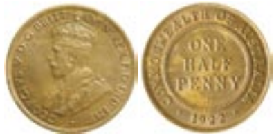
1558* George V, 1922. Brown and red uncirculated.