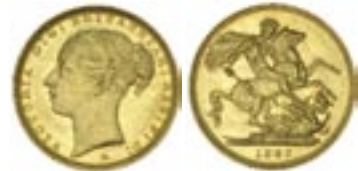
1343* Queen Victoria, 1887 Melbourne. Good extremely fine. $350