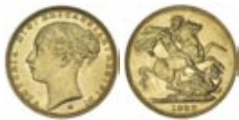
1345 Queen Victoria, Jubilee head, 1887 Melbourne, small JEB (S.3867). Lightly toned, good extremely fine. $150