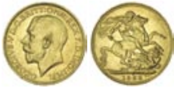
1366* George V, 1922 Sydney. Nearly uncirculated and extremely rare. $25,000