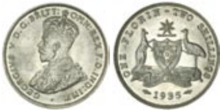
1479* George V, 1935. Uncirculated.