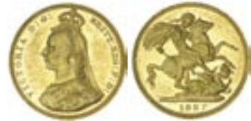
1346* Queen Victoria, Jubilee head, 1887 Melbourne, normal JEB (S.3867 A). Reflective fields, nearly uncirculated. $250