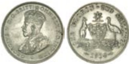
1461* George V, 1914. Hairline die break from date to rim at 6 o'clock, lightly rubbed mostly original surface good extremely fine and scarce in this condition.