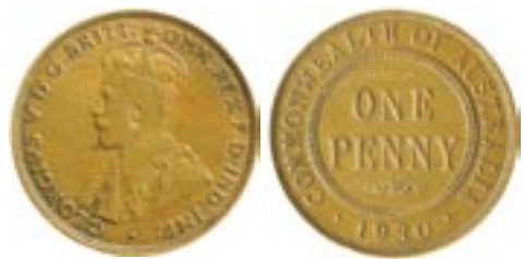
1543* George V, 1930. Six clear pearls, even brown patina, good fine and rare.