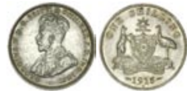
1488* George V, 1915H. With some original mint bloom, toned reverse, extremely fine.