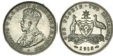
1464* George V, 1915. Rim nick and polished otherwise a well struck up extremely fine and rare in this condition.