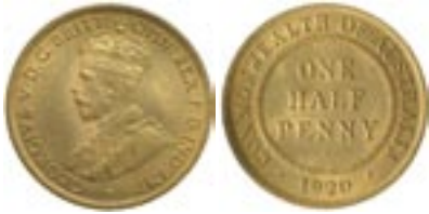
1556* George V, 1920. Full original mint red, uncirculated.