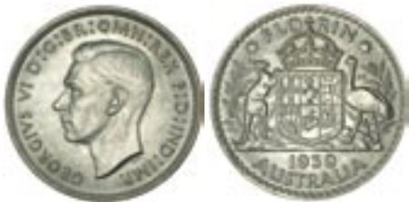
1482* George VI, 1939. Well struck, uncirculated and rare in this condition.