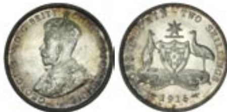
1466* George V, 1916M. Full frosty iridescent mint bloom, minute die breaks on the reverse, minor contact marks behind head otherwise choice or gem uncirculated and rare thus.