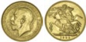
1365* George V, 1922 Melbourne. Nearly uncirculated with matte fields on obverse, very rare. $10,000