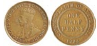
1563* George V, 1923. Rim bruises otherwise medium brown nearly very fine.