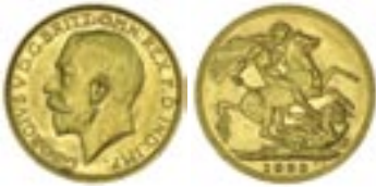
1363* George V, 1920 Melbourne. Good extremely fine and rare. $6,000