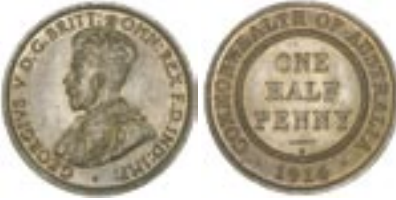
1555* George V, 1914H. Dark red or lilac mint bloom, uncirculated and rare thus.