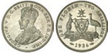
1480* George V, 1936. Unmarked full original bloom, gem uncirculated.