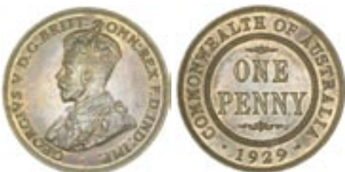
1539* George V, 1929, Indian die. Brown and red, nearly uncirculated.