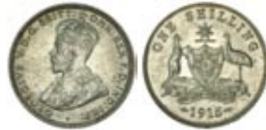
1487* George V, 1915. Considerable mint bloom, weak on last two pearls, hairline die break from emu to scroll, minor surface mark behind emu otherwise nearly extremely fine/ extremely fine and rare in this condition.