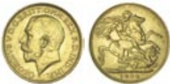
1367* George V, 1924 Sydney. Scratch on neck otherwise extremely fine and rare. $2,500