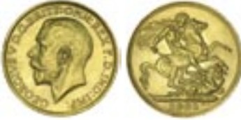
1364* George V, 1921 Sydney. Well struck except for mint mark, otherwise nearly uncirculated and rare. $1,500