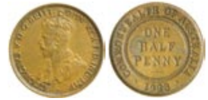
1562* George V, 1923. Centre diamond and almost eight pearls even brown patina with wax wiped over, good very fine and rare in this condition.