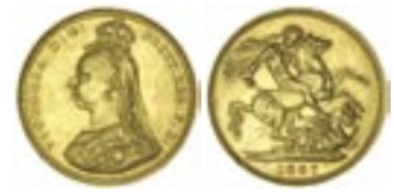
1348* Queen Victoria, Jubilee head, 1887 Sydney. Light scratches behind head and horse, otherwise good extremely fine and very scarce in this condition. $500