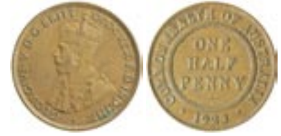
1560* George V, 1923. Very fine and rare in this condition.