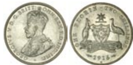
1467* George V, 1916M. Full mint bloom, minor contact marks, otherwise uncirculated.