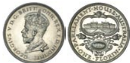
1402* George V, Melbourne Mint proof Canberra florin 1927. Nearly FDC and rare.