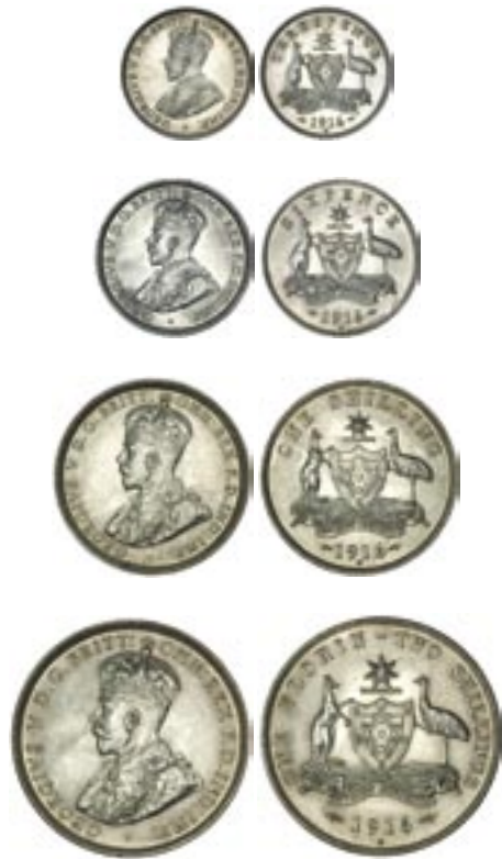
1400* George V, Melbourne Mint proof or specimen set, 1916M, with official plush blue leather case of issue. The threepence a brilliant finish with very high rims, the sixpence semi brilliant on the reverse, satin like on obverse and with two or three minute contact hairlines, the shilling with die breaks on the reverse, frosty bloom with obverse contact marks, the florin with spiralling or cartwheeling mint bloom and minute contact marks, the whole set has been silver dipped and has minor mis-handling otherwise nearly FDC and very rare. (4)