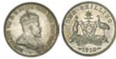
1484* Edward VII, 1910. Toned, nearly uncirculated.