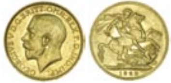
1372* George V, 1928 Melbourne. Nearly uncirculated and rare. $3,500