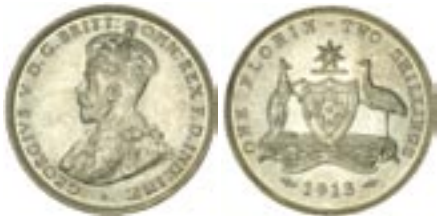
1459* George V, 1913. Considerable original mint bloom, virtually uncirculated and very rare in this condition.