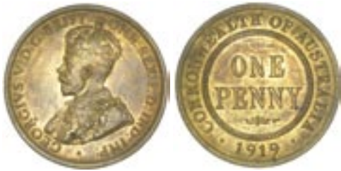
1535* George V, 1919. Red and brown, uncirculated.