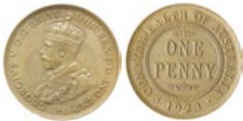
1537* George V, 1923 London. Dark brown patina well struck with doubled denticles in places, nearly uncirculated.