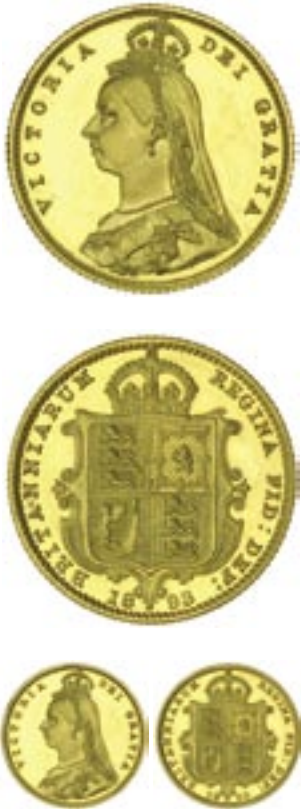
1398* Queen Victoria, Melbourne Mint proof Jubilee head half sovereign, 1893. A brilliant and frosted proof, nearly FDC and extremely rare.