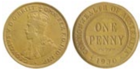
1542* George V, 1930. Six clear pearls and part centre diamond, edge bruise otherwise attractive even brown patina, nearly very fine and rare.