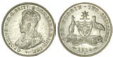
1462* George V, 1914H. Original frosty mint bloom, nearly uncirculated/ uncirculated and very rare in this condition.