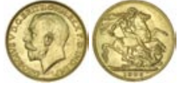
1370* George V, 1926 Perth. Nearly uncirculated and rare. $2,500