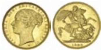
1340* Queen Victoria, 1886 Melbourne. Nearly full original mint bloom, uncirculated. $500