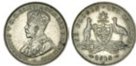
1465* George V, 1915H. Good very fine, obverse a little polished.