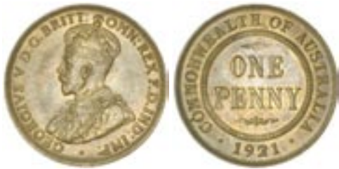
1536* George V, 1921, Indian die. Red and brown uncirculated and rare in this condition.