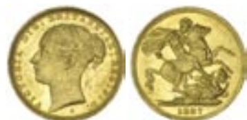
1344* Queen Victoria, 1887 Sydney. Good extremely fine. $350