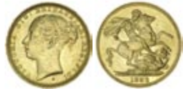
1342* Queen Victoria, 1886 Sydney. Full mint bloom, uncirculated. $750