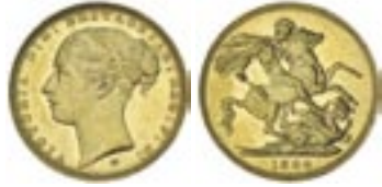
1337* Queen Victoria, 1884 Melbourne. Brilliant uncirculated. $800