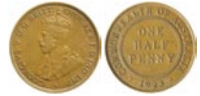
1561* George V, 1923. Even brown patina, very fine and rare in this condition.