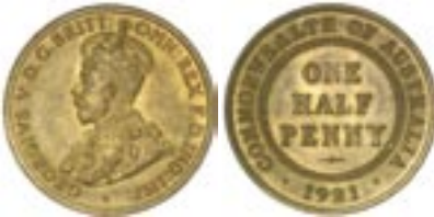
1557* George V, 1921. Dull full original mint red, uncirculated.