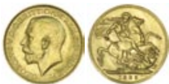
1368* George V, 1925 Perth. Well struck, good extremely fine. $350