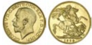
1373* George V, 1928 Perth. Uncirculated and scarce thus. $300