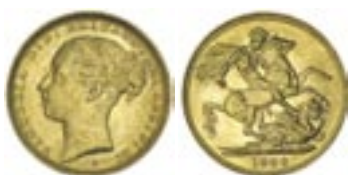
1341* Queen Victoria, 1886 Sydney. Uncirculated. $900