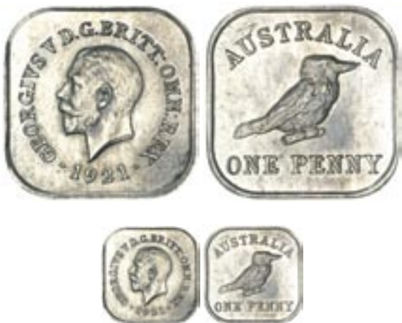
1399* George V, Melbourne Mint pattern square cupro - nickel kookaburra penny, 1921, by Sir E.B. Mackennal (R.12). Light and dark grey toned, nearly uncirculated and rare.