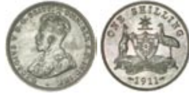
1485* George V, 1911. Underlying mint bloom, lightly toned blue and lilac grey patina, nearly uncirculated.