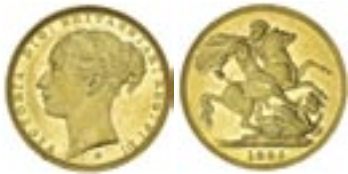
1338* Queen Victoria, 1885 Melbourne. Nearly uncirculated. $400