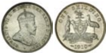
1483* Edward VII, 1910. Uncirculated.