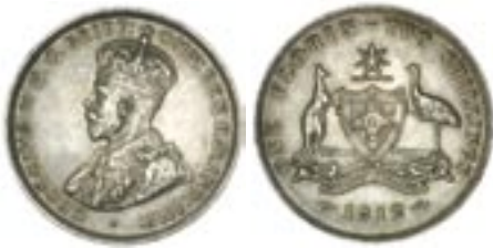
1458* George V, 1912. Toned, nearly extremely fine and rare thus.