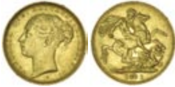
1336* Queen Victoria, 1883 Sydney. Good very fine/ extremely fine. $200