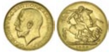
1369* George V, 1926 Perth. Good extremely fine and rare. $2,500