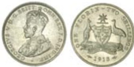
1460* George V, 1913. Nearly uncirculated/ uncirculated and rare in this condition.