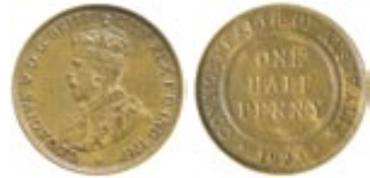
1559* George V, 1923. Cleaned and re-toned, very fine and rare.