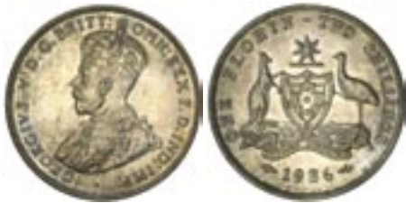
1481* George V, 1936. Lightly toned, uncirculated.