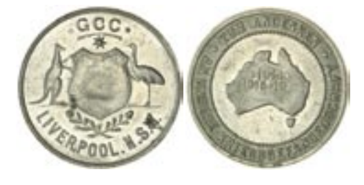
1100* G.C.C. (German Concentration Camp), Liverpool, N.S.W. (C.1916/4 aluminium). Nearly extremely fine . $250