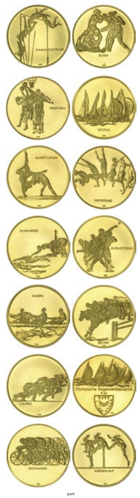
1124* Munich 1972, official commemorative set of seventeen proof gold medallions (32mm) (900 fine, total weight 297.5gms). In original case. Nearly FDC . (17)