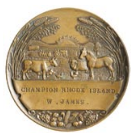
1016* Royal Melbourne Centenary Show, 1948, Elizabeth and Phillip, in bronze (54mm) by Stokes, impressed on reverse 'Champion Rhode Island / W.James'. Extremely fine .