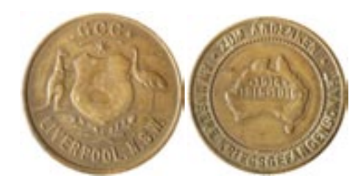
1099* G.C.C. (German Concentration Camp), Liverpool, N.S.W. (C.1916/4 copper). Very fine .