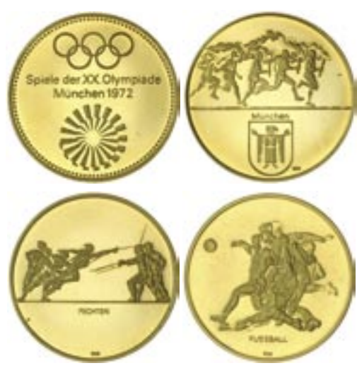
Lot 1124 (part)