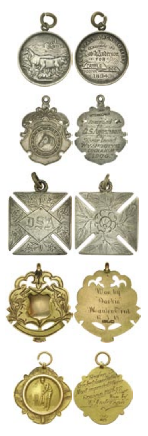
Lot 952 (part)

Richmond River A.H.& P.Society, Casino, in silver, with loop mount (23.5mm x 34mm) by E.Altmann, inscribed on reverse 'W.Weary / for / Hereford Heifer / 1 year & under 2 / Young Biddy / 1889'. Very fine .