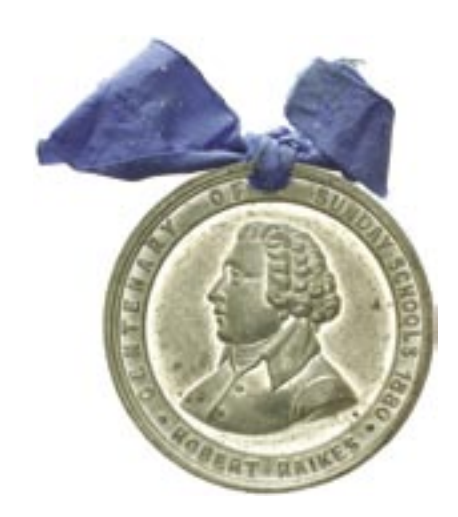
Lot 1037 obverse