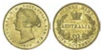
605* Queen Victoria , second type, 1864. Some mint bloom, extremely fine or better.