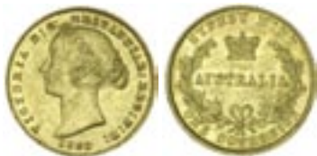
599* Queen Victoria , second type, 1860. Surface marked, nearly extremely fine and rare thus.