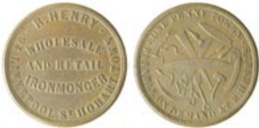
863* Henry, R. , Hobart penny, undated (A.225) with straight grained (or milled) edge. Good very fine. $500