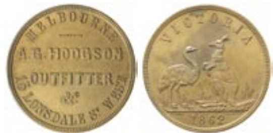
868* Hodgson, A.G. , Melbourne proof penny, 1862 (A.257). Light red and brown almost matte fields, nearly FDC and rare. $750

Ex A.H.F. Baldwin (lot 198) and Utrecht (lot 1009) collections.