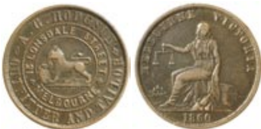
865* Hodgson, A.G. , Melbourne penny, 1860 (A.255) West omitted. Dark brown, toned very fine and very rare. $700

Ex J.L. Griffin and the Reserve Bank of New Zealand Collections (lot 254).