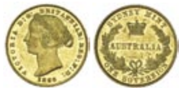
609* Queen Victoria , second type, 1866. Nearly uncirculated with proof-like mirror fields.