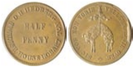
862* Hedberg, O.H. , Hobart mule halfpenny, undated (A.212) muled with reverse of Dease. Light brown mint bloom, nearly FDC and rare. $2,500

Ex J.C.Freeman (lot 325) Collection and Osborne (lot 847) Collection.