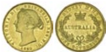
600* Queen Victoria , second type, 1860. Good very fine and rare.