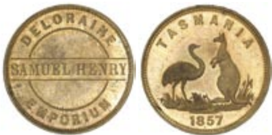
864* Henry, Samuel , Deloraine penny, 1857 (A.226). Full original mint red, FDC and rare in this condition. $1,500

Ex A.H.F. Baldwin (lot 198) and Utrecht (lot 1009) collections.