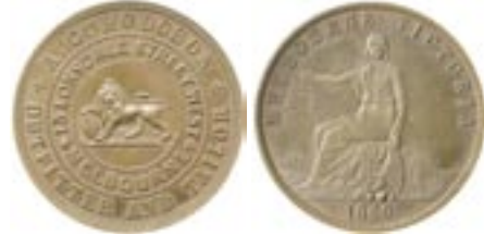
867* Hodgson, A.G. , Melbourne proof halfpenny, 1860 (A.256). Deep lilac toned, nearly FDC and rare thus. $750