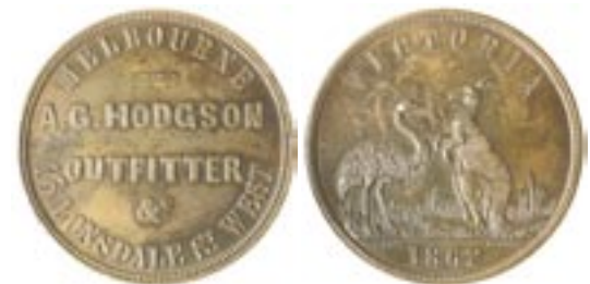
869* Hodgson, A.G. , Melbourne penny, 1862 (A.257). Partly lacquered dark grey brown good extremely fine proof-like striking. $400

Ex J.L. Griffin and the Reserve Bank of New Zealand Collections (lot 254).