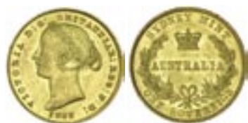
610* Queen Victoria , second type, 1866. Extremely fine/ good extremely fine.