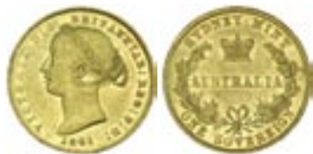
602* Queen Victoria , second type, 1861. Very fine/ good very fine.