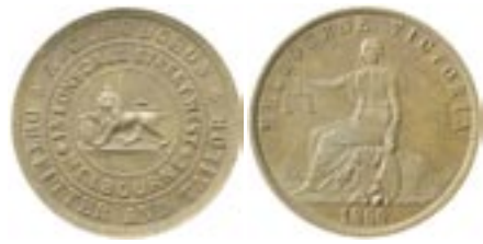
866* Hodgson, A.G. , Melbourne proof halfpenny, 1860 (A.256). Grey brown patina with traces of red, FDC and very rare thus. $1,500

Ex J.C.Freeman (lot 325) Collection and Osborne (lot 847) Collection.