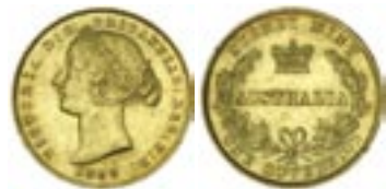
606* Queen Victoria , second type, 1865. Nearly extremely fine.