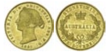
607* Queen Victoria , second type, 1865. Good very fine/ nearly extremely fine.