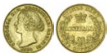
611* Queen Victoria , second type, 1866. Nearly extremely fine.