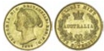
608* Queen Victoria , second type, 1866. Full frosty mint bloom, nearly uncirculated.