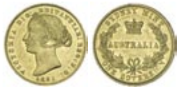
601* Queen Victoria , second type, 1861. Some mint bloom with minor friction, extremely fine and rare.