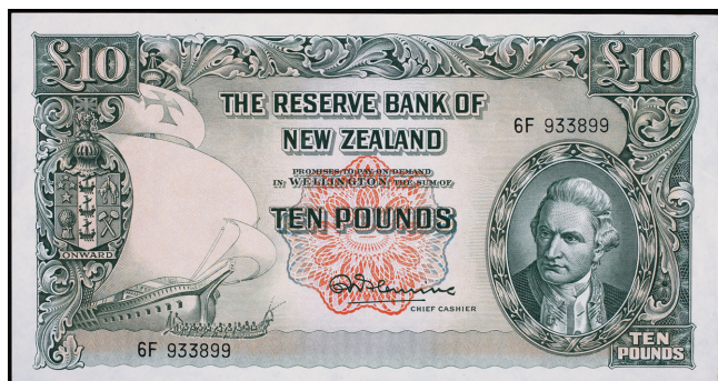
3562* New Zealand, Reserve Bank of New Zealand, R.N.Fleming (1956-67), ten pounds, without security thread, 6F 933899, first prefix (P.161c). Nearly uncirculated.