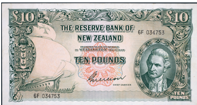
3558* New Zealand, Reserve Bank of New Zealand, G.Wilson (1955-56), ten pounds, 6F 034753, last prefix of signature (P.161b). Flattened of folds, very fine.