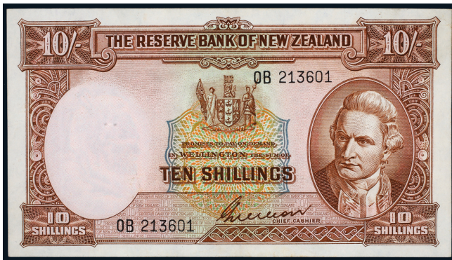
3556* New Zealand, Reserve Bank of New Zealand, G.Wilson (1955-56), ten shillings, OB 213601 (P.158b). Nearly uncirculated.